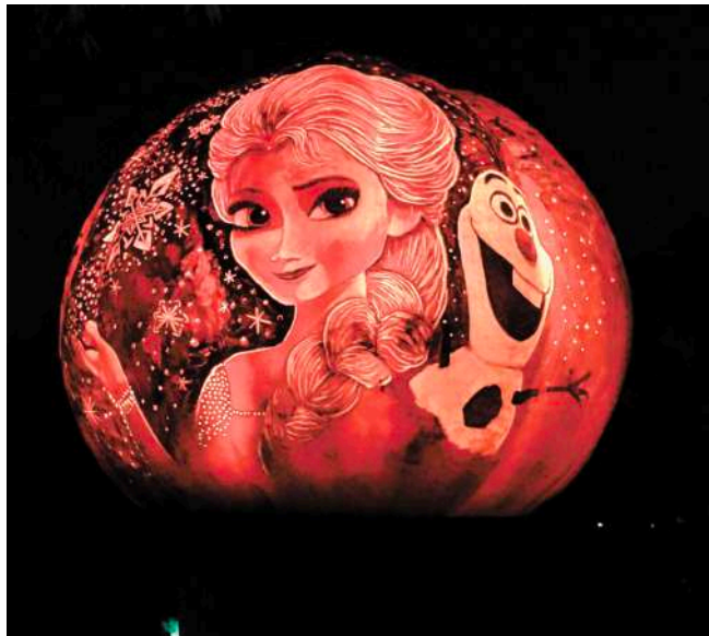
The children happily meet the Snow Queen.

During the wait, I am documenting myself a little. I learn that 115 000 to 140 000 people go each year to admire the 5000 pumpkins sculpted by professionals. In fact, they must do the double work and carve 10,000, because the pumpkin is degraded over the days. Finally, I discover that this show is an important fundraiser for the Roger Williams Park Zoo. The proceeds are used to support animal welfare, environmental education and conservation efforts both locally and around the world.