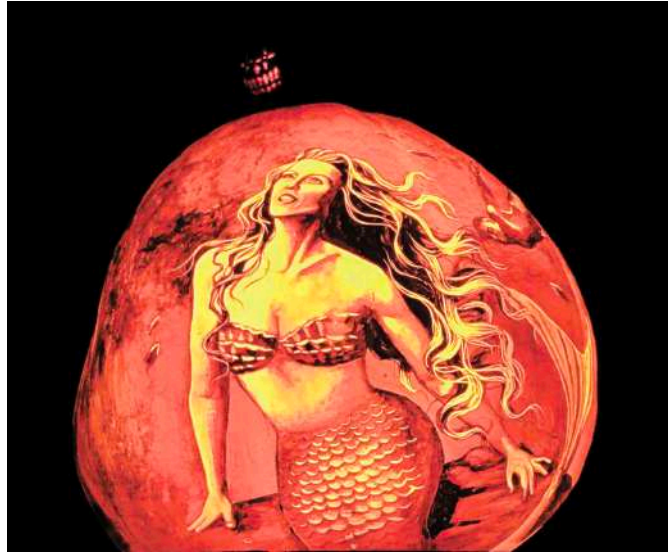
The little Mermaid.

This reading time allowed me to reach the path and observe my first pumpkins. There, I remain speechless!