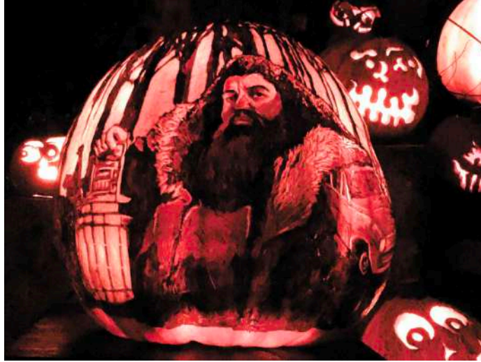
Hagrid, the nice giant of Harry Potter.

Some pumpkins are so beautiful that we say that the design had to be done by laser or stencil, but no. All pumpkins are hand-crafted and sculpted by artists at Passion for Pumpkins, a multimedia company in Oxford, Mass., which produces shows across the country.