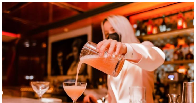
The Peach Bellini in which I was obsessed with

The Filet Mignon here is a true work of art. Every bite offers a satisfying, lingering finish that makes you want to savor each moment. To complement the meal, I continued my Peach Bellini indulgence—after all, it's the signature drink of the entire hotel.