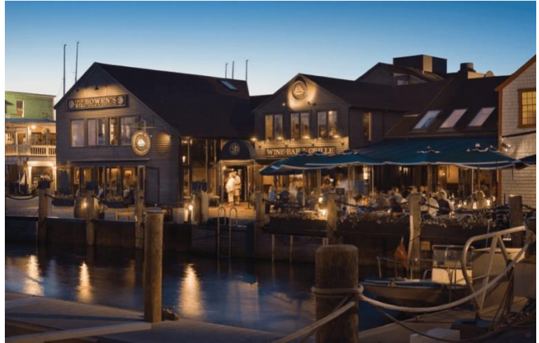
Bowen's Wharf, Credit: Visit Rhode Island

through the area, you'll enjoy splendid harbor views, maritime activities, and a variety of year-round events. Sailing tours and boat charters offer a glimpse into Newport's rich maritime heritage.