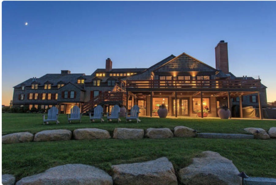
The Weekapaug Inn, Westerly, Rhode Island