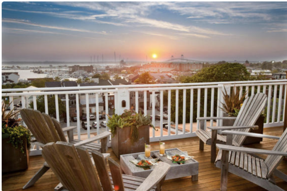
The Vanderbilt, Newport, Rhode Island