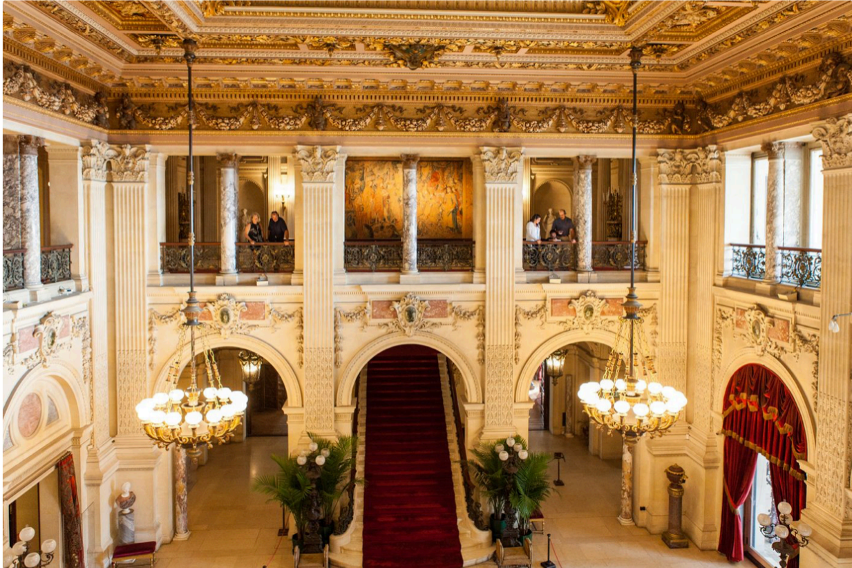
The most famous Newport mansion is The Breakers, the summer home of the Vanderbilt family.

The Lawn at Castle Hill Inn, once a Gilded Age summer house built in 1875 and now a boutique hotel, is the best location for sunset cocktails in Newport. Adirondack chairs dotting the property's lawn overlook Narragansett Bay and are the ideal spot to end a day in Newport. Visit another former mansion-turned-hotel, The Vanderbilt, for cocktails and views on their rooftop deck.