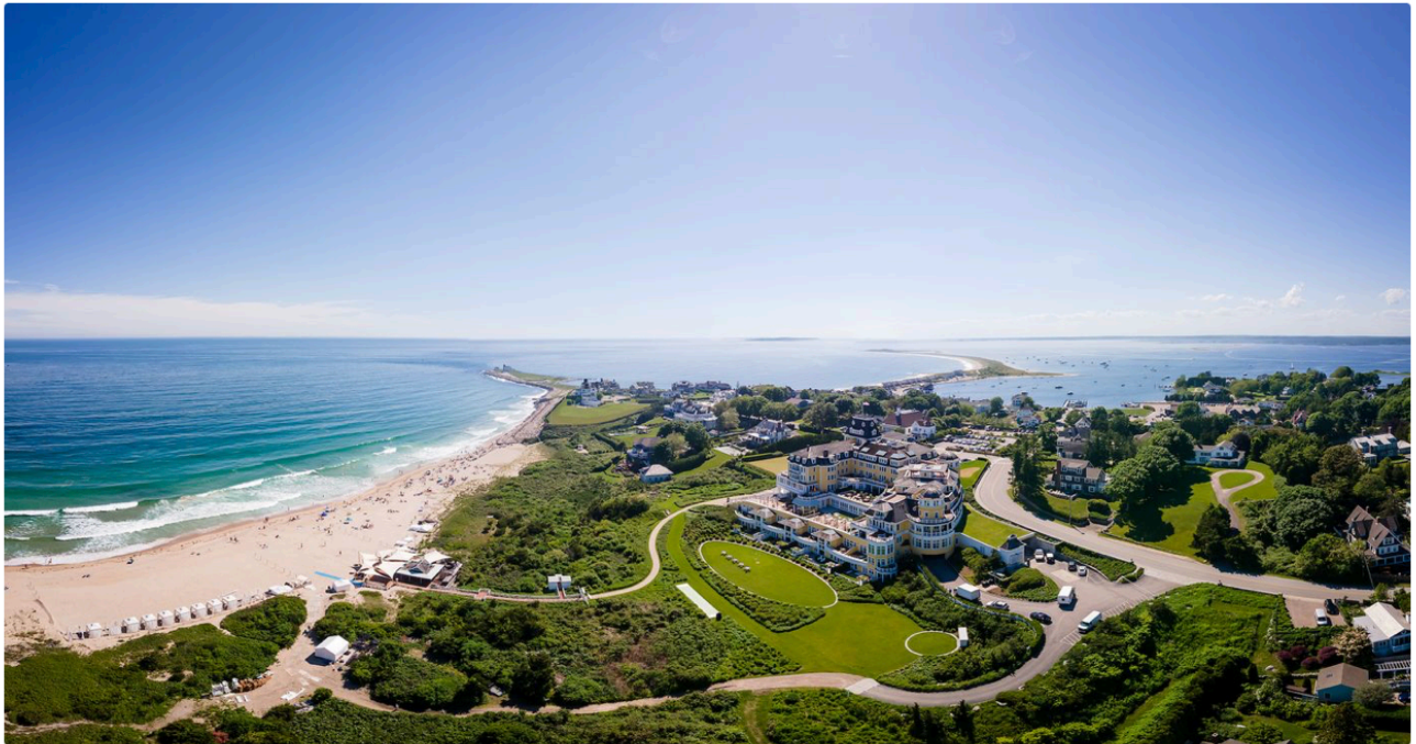
Ocean House resort is located on a bluff in Watch Hill overlooking its private beach. Ocean House

Despite being the smallest state in the U.S., Rhode Island is packed with experiences, accommodations, and activities for the luxury-minded traveler. While Newport is the star of the state, there is much to see and explore in the surrounding areas, and driving throughout Rhode Island is easy given the state's small size.