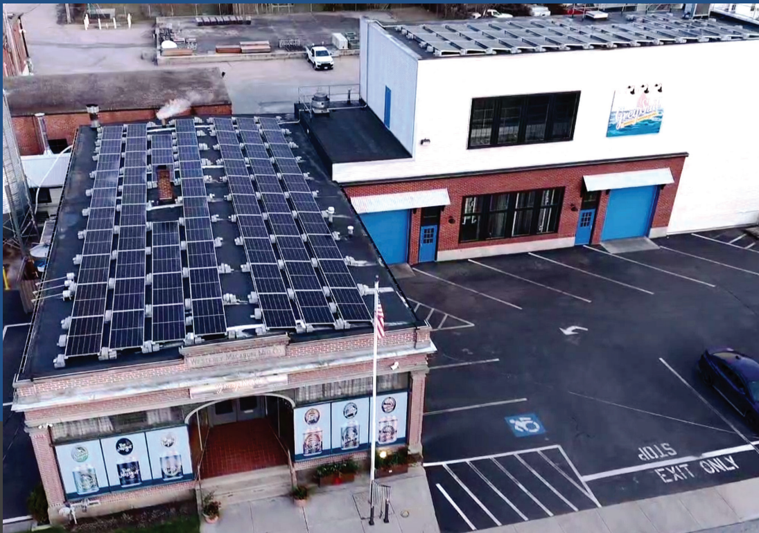
Grey Sail Brewing Westerly, Rhode Island

RENEWABLE ENERGY FUND POWERED BY RHODE ISLAND COMMERCE