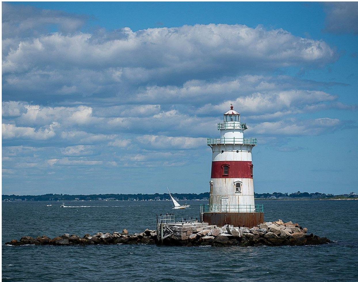
Rhode Island.

Some of the links on our site may contain affiliate links. This means if you click on the link and purchase the item, we may receive an affiliate commission at no extra cost to you. All opinions remain our own.