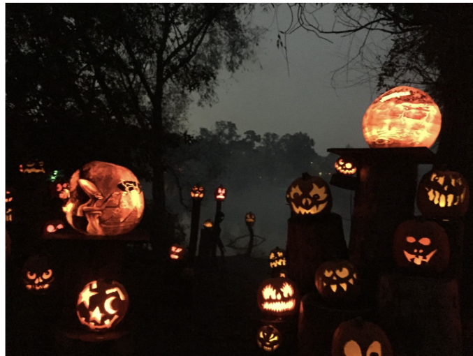
See more than 5,000 intricately carved pumpkins up close at the Jack-O-Lantern Spectacular in Providence's Roger Williams Park Zoo through Oct. 31.