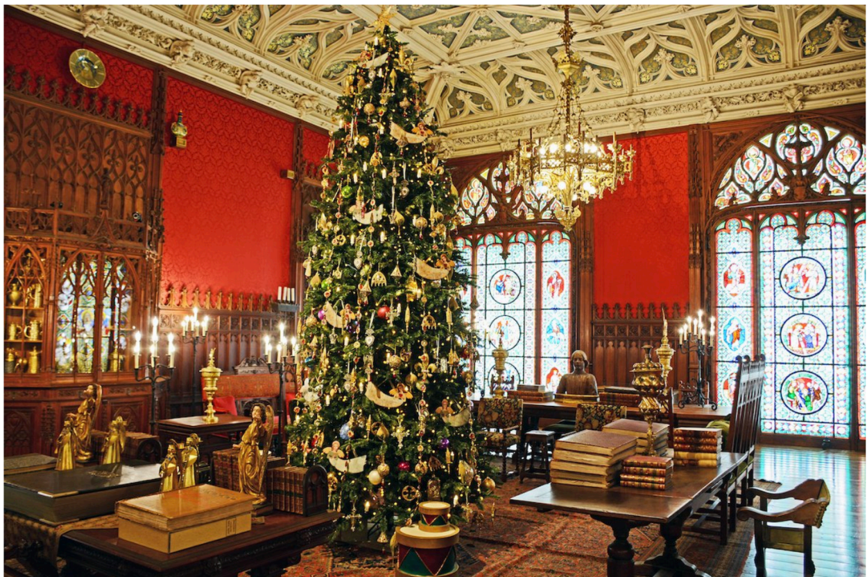
MARBLE HOUSE

Explore the “Sparkling Lights at The Breakers” as you wander the meandering outdoor paths of stunning lighting displays and many other festive touches that will surprise and delight you. Be sure not to miss the legendary 15-foot tall Poinsettia Christmas Tree, the grand centerpiece of the Great Hall where 150 Poinsettia plants stand as one to create a magnificent showstopper.