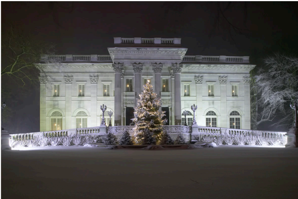
MARBLE HOUSE

Before you board the special Polar Express run to the North Pole, the whole family can enjoy a special pre-trip holiday show and pose for seasonal photos. Tickets can be purchased online through the Blackstone Valley Tourism Council .