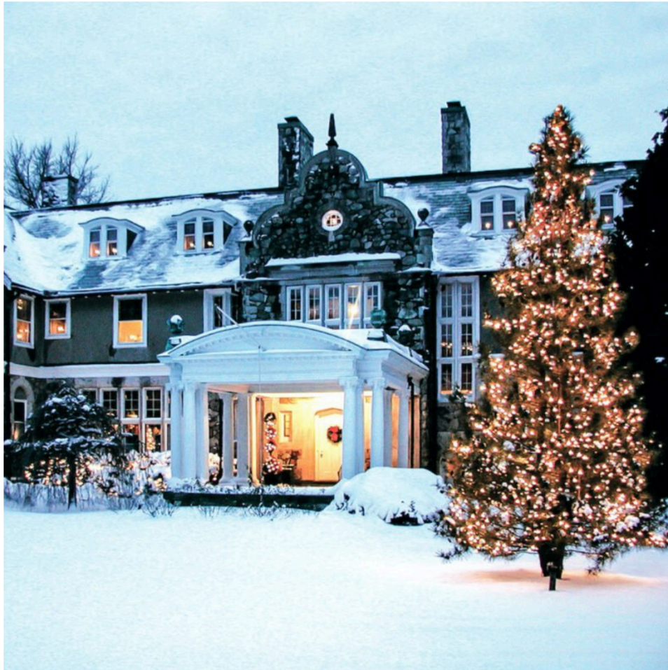
BLITHEWOLD MANSION

Rhode Island puts on an amazing list of holiday events to celebrate the festive Christmas season. Whether you visit Newport's stunning mansions and fun traditions, Bristol's Blithewold Mansion Gardens, Providence's Roger Williams Park Zoo's lighting extravaganza, or Woonsocket's popular Polar Express , you will be guaranteed to be filled with holiday cheer.