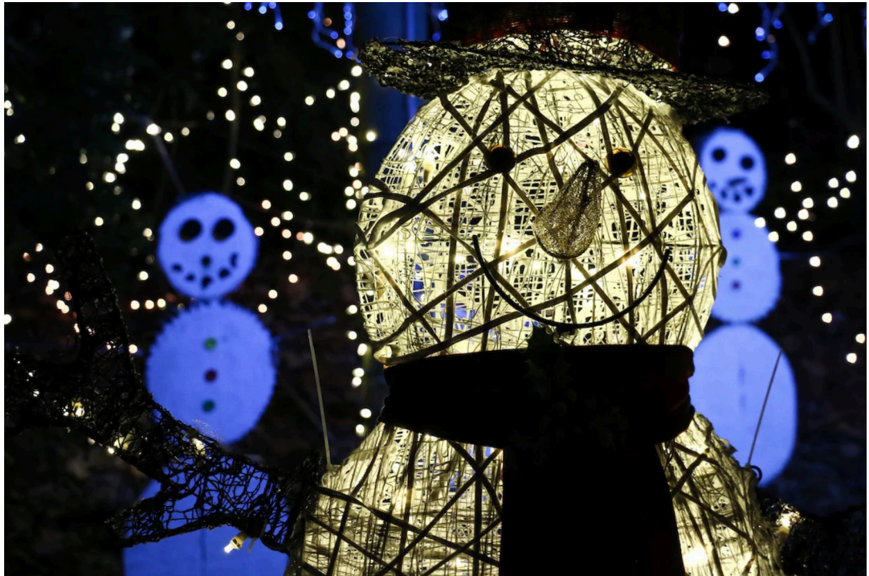
RODGER WILLIAMS PARK ZOO