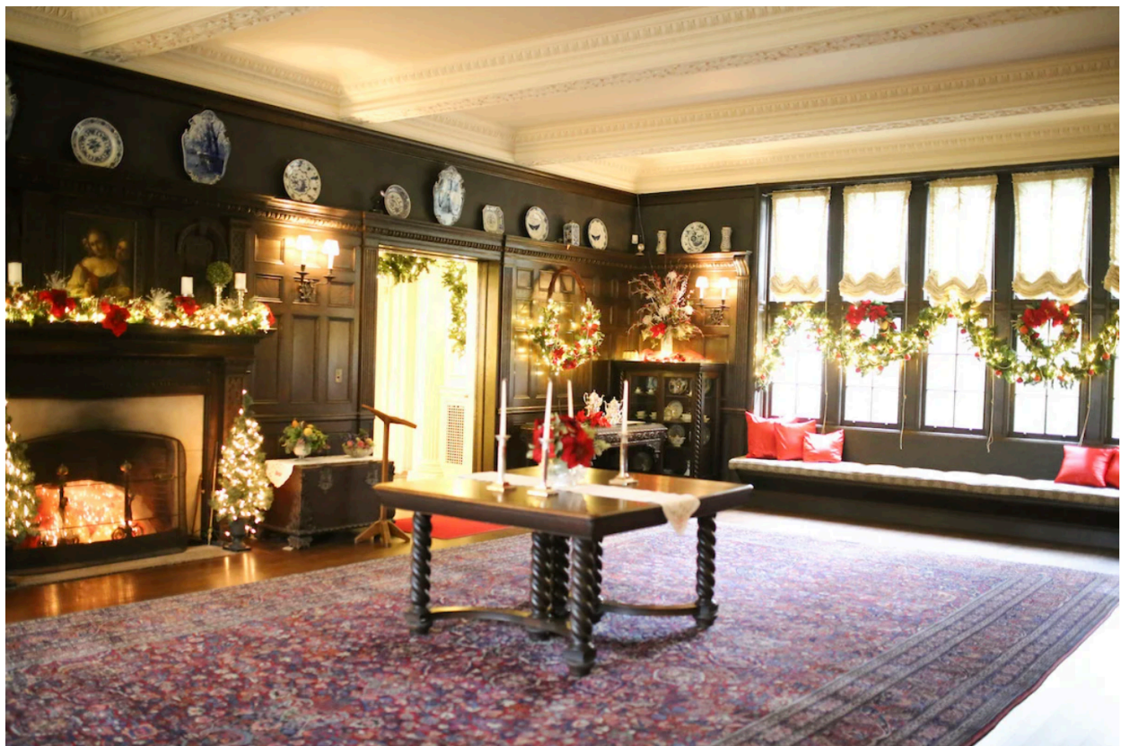
BLITHEWOLD MANSION

Reservations are not required. You can purchase your tickets online or at the Newport Mansions.