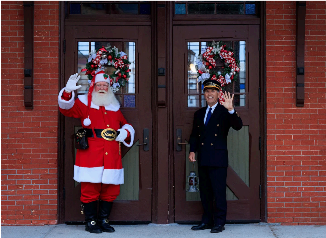
POLAR EXPRESS

Tickets must be purchased in advance and are available online here .