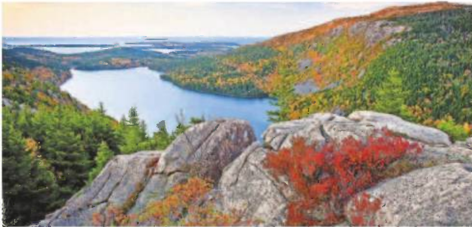
Acadia National Park in Maine offers stunning sights during autumn visits.