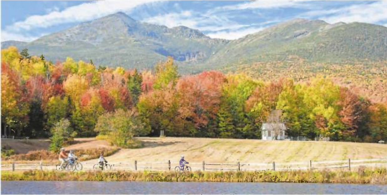
Gorham, N.H., boasts an outdoor center which offers outdoor explorations on foot or mountain bike.