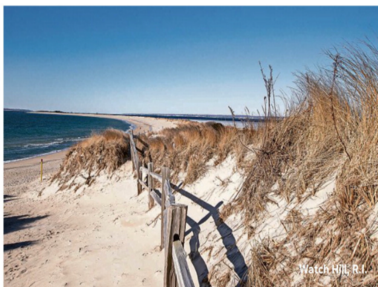
Watch Hill, R.I.

Elsewhere in South County, beaches abound. Favorites include Watch Hill's Napatree Point Conservation