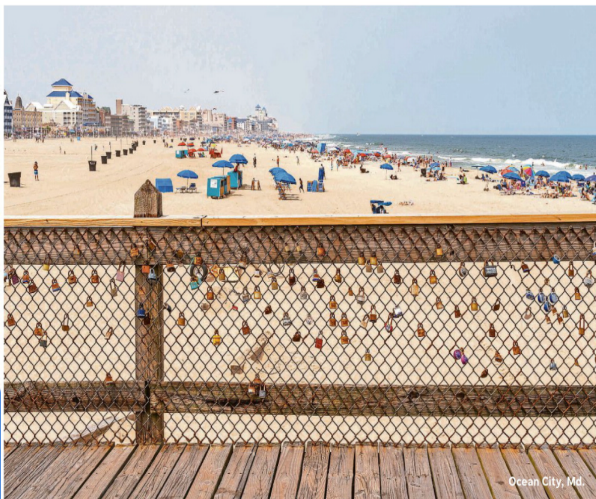
Ocean City, Md.