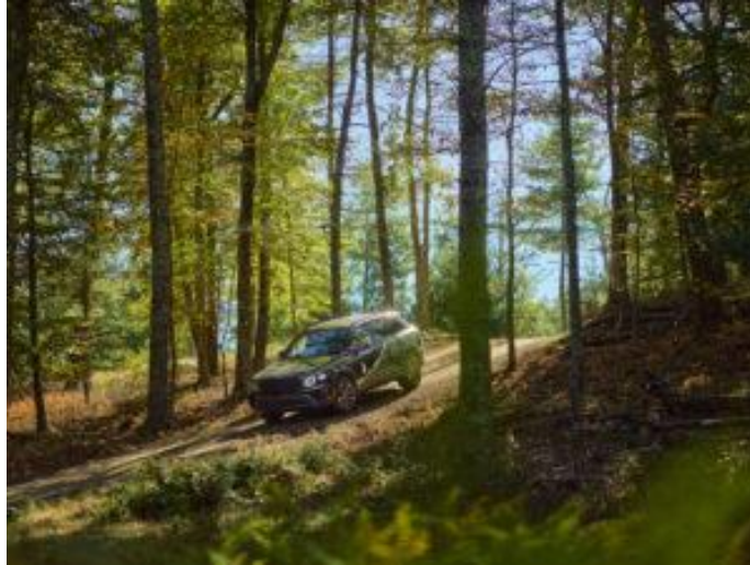
Ride in Bentley style at The Preserve Resort & Spa.

If you're going to holiday in style, you want to ride in style too, right? Whether or not you opt to try your hand at their Off-Road Driving Experience (driving aficionados can enjoy a one-of-a-kind off-roading experience behind the wheel of a Bentley Bentayga vehicle), you can still ride shotgun in one throughout the property. It's the official ride of the resort so they'll also pick you up from the airport or train station, upon request, in the chic vehicles as well.