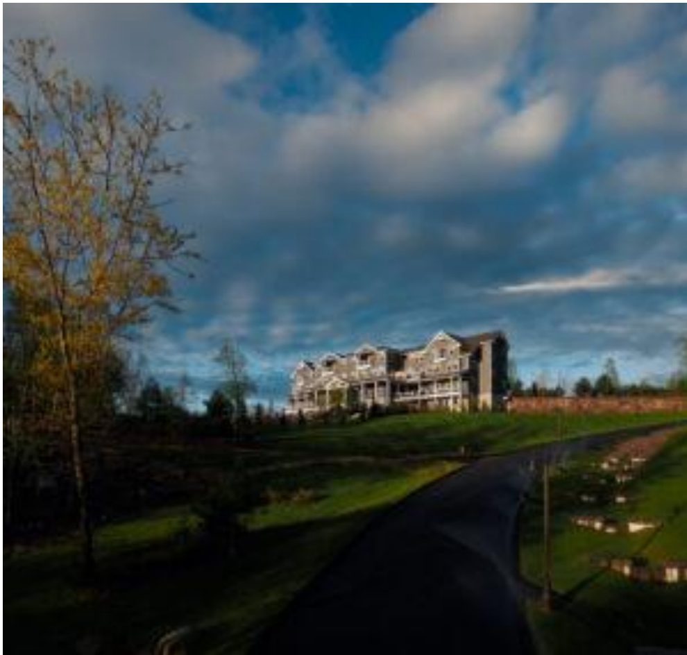
Hilltop Lodge at The Preserve Resort & Spa in Richmond, Rhode Island.

The adults-only Hilltop Lodge offers incredibly spacious, multi-bedroom suites, with every amenity of home from the modern, world-class kitchen and fridge stocked with beverages (including home-grown Rhode Island brews) to the peaceful tranquility in the bedroom as you overlook the never-ending canopy of trees that beckon you to come outside.