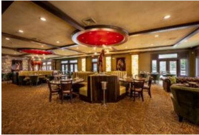
Double Barrel Steak at The Preserve Resort & Spa.