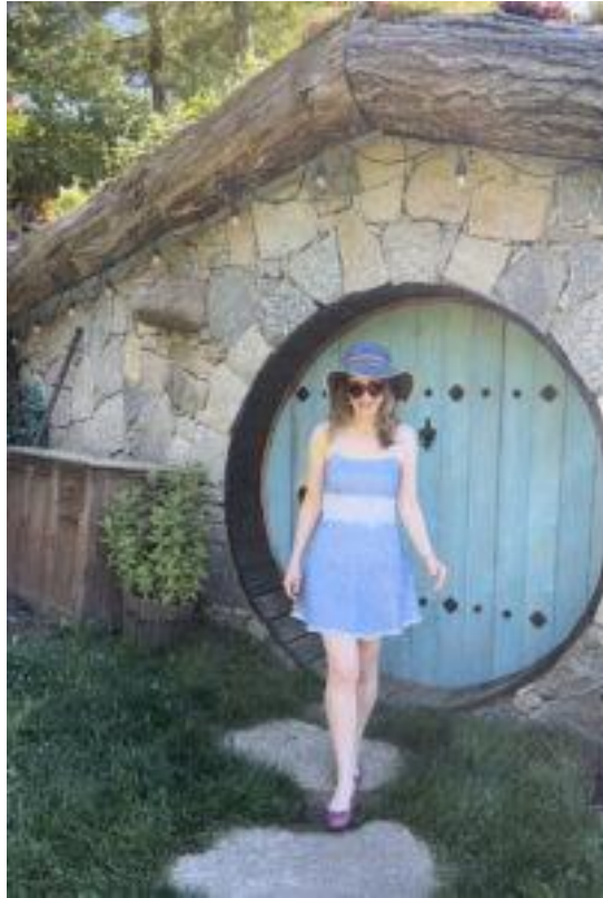
Visiting the Hobbit Houses at The Preserve Resort & Spa.

All of the enchanting houses are built right into the landscapes with a storybook-like charm — from the stone paths that lead up to them, through the individually carved and decorated, round wooden doors that swing open leading you into another entirely ethereal world.