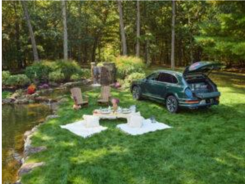
Picnic at The Preserve Resort & Spa in Richmond, Rhode Island.

Sitting on 3,500 acres, a visit to the resort is an entirely immersive experience. Even if you weren't in the nation's smallest state, this is a lot of land.