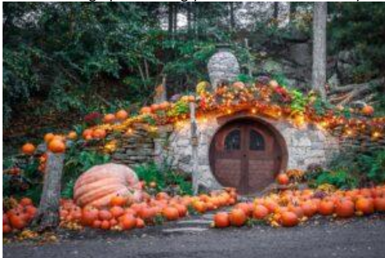
The Hobbit Houses are a delight at The Preserve Resort & Spa.

All of the enchanting houses are built right into the landscapes with a storybook-like charm — from the stone paths that lead up to them, through the individually carved and decorated, round wooden doors that swing open leading you into another entirely ethereal world.