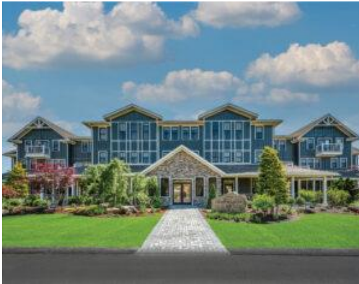
Stay VIP at the Hilltop Lodge at The Preserve Resort & Spa in Richmond, Rhode Island.

Typically, once you decide which hotel or resort, you're staying in, this question has already been more or less decided, right?