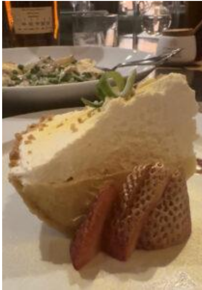
Indulge in the “Not So Humble” Key Lime Pie and Lobster Ravioli at Double Barrel Steak at The Preserve Resort & Spa.

For dinner, you can savor one of their famous steaks or order the Lobster Ravioli , a little slice of indulgent pasta heaven with wild mushrooms, peas, and tarragon brandy cream.