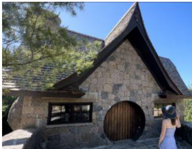
Ready to check in to a Hobbit House? You soon can at The Preserve Resort & Spa.

But like everything at The Preserve, you'll have an abundance of posh choices for accommodations — including luxurious private cabins, townhomes, tiny homes, a multi-bedroom suite in the Hilltop Lodge, an equestrian home and cottage where horses can graze right outside your doors, and soon, even an overnight stay in a Hobbit House.