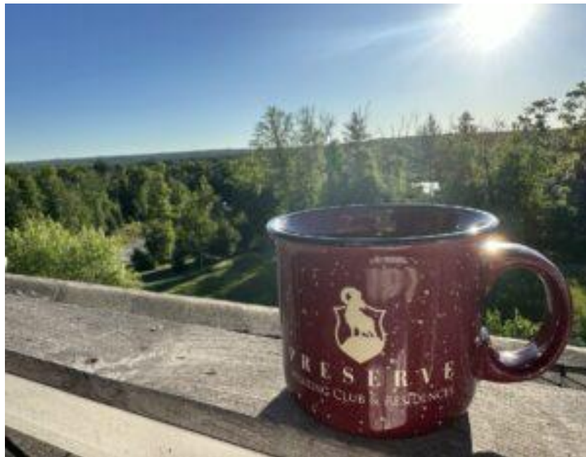
Overlooking the great outdoors from the balcony suite at the Hilltop Lodge at The Preserve.

Sitting on 3,500 acres, a visit to the resort is an entirely immersive experience. Even if you weren't in the nation's smallest state, this is a lot of land.