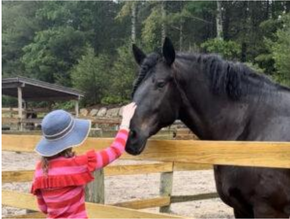
Say hello to the horses at The Preserve Resort & Spa.

At a property like The Preserve, the better question may almost be ‘what is there not to do?’ because the resort seems to have an impossibly long list of amenities and activities... and that’s before you even start to think of visiting any of Rhode Island’s nearby beaches or neighboring towns.