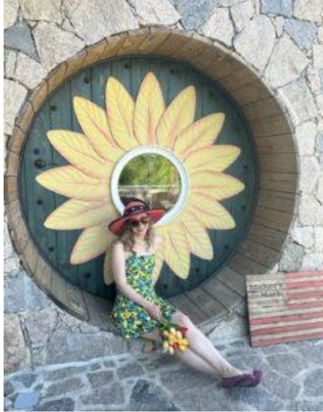
Hobbit House at The Preserve Resort & Spa.

And whether or not you've ever found yourself daydreaming you were part of a Lord of the Rings remake... or dressing up for San Diego's Comic-Con, you'll still fall in love with the iconic Hobbit Houses. They're so Instagram-friendly that it'd be hard not to want to take a photo shoot there. And photo shoot them I did.