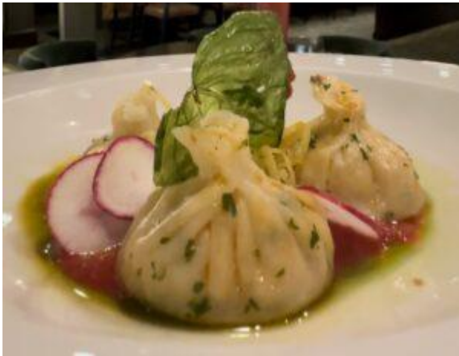
The Lobster Dumplings are a lighter than air appetizer offered at Double Barrel Steak at The Preserve Resort & Spa.