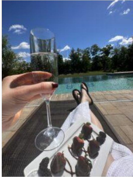
Relax at OH! Spa at The Preserve Resort & Spa.

Spa amenities include an outdoor infinity pool as well as two large, heated whirlpools, and a cold plunge shower. Further relax in the serenity of the locker room's saunas and steam showers.