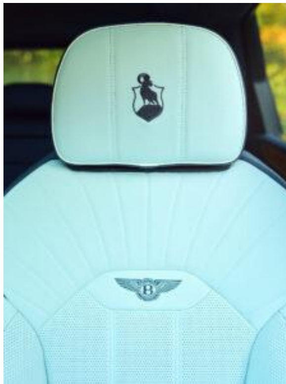
Ride in Bentley style at The Preserve Resort & Spa.

If you're going to holiday in style, you want to ride in style too, right? Whether or not you opt to try your hand at their Off-Road Driving Experience (driving aficionados can enjoy a one-of-a-kind off-roading experience behind the wheel of a Bentley Bentayga vehicle), you can still ride shotgun in one throughout the property. It's the official ride of the resort so they'll also pick you up from the airport or train station, upon request, in the chic vehicles as well.