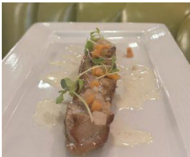
Tuna Tataki Aburi at Double Barrel Steak at The Preserve Resort & Spa.

Want some lighter fare? Or perhaps you're coming from a sesh at the spa? The restaurant has you covered with an appetizer serving of their lighter than air Lobster Dumplings — prepared with chili oil, tomato miso, basil, and preserved lemon. They're so light that you'll want to pair them with the equally delicious Tuna Tataki Aburi , topped with smoked shoyu, triad piquant poivron, wasabi crema, and onion ponzu salsa.