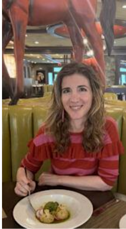
Enjoy the Lobster Dumplings at Double Barrel Steak at The Preserve Resort & Spa.

Want some lighter fare? Or perhaps you're coming from a sesh at the spa? The restaurant has you covered with an appetizer serving of their lighter than air Lobster Dumplings — prepared with chili oil, tomato miso, basil, and preserved lemon. They're so light that you'll want to pair them with the equally delicious Tuna Tataki Aburi , topped with smoked shoyu, triad piquant poivron, wasabi crema, and onion ponzu salsa.