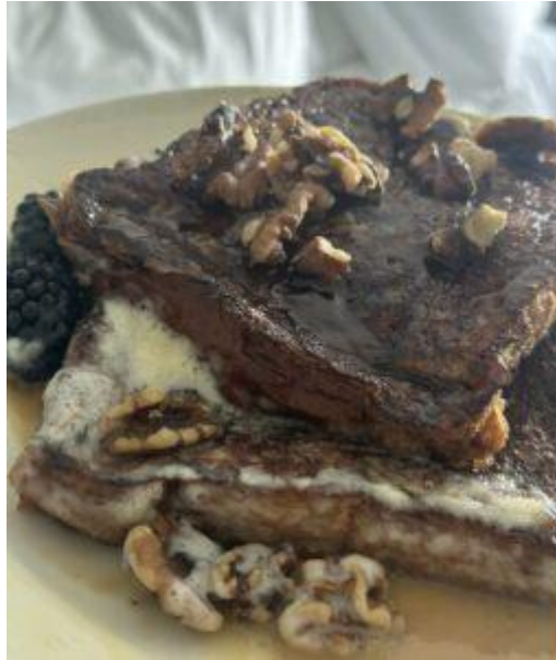
The Bourbon Maple French Toast delivered right to the room from Double Barrel Steak at The Preserve Resort & Spa.

For breakfast, the menu ranges from perennial classics like buttermilk pancakes and omelets to trendier options like avo toast or fried chicken and waffles.