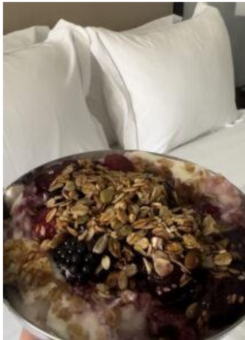
The Greek Yogurt Parfait delivered right to the room from Double Barrel Steak at The Preserve Resort & Spa.

For breakfast, the menu ranges from perennial classics like buttermilk pancakes and omelets to trendier options like avo toast or fried chicken and waffles.