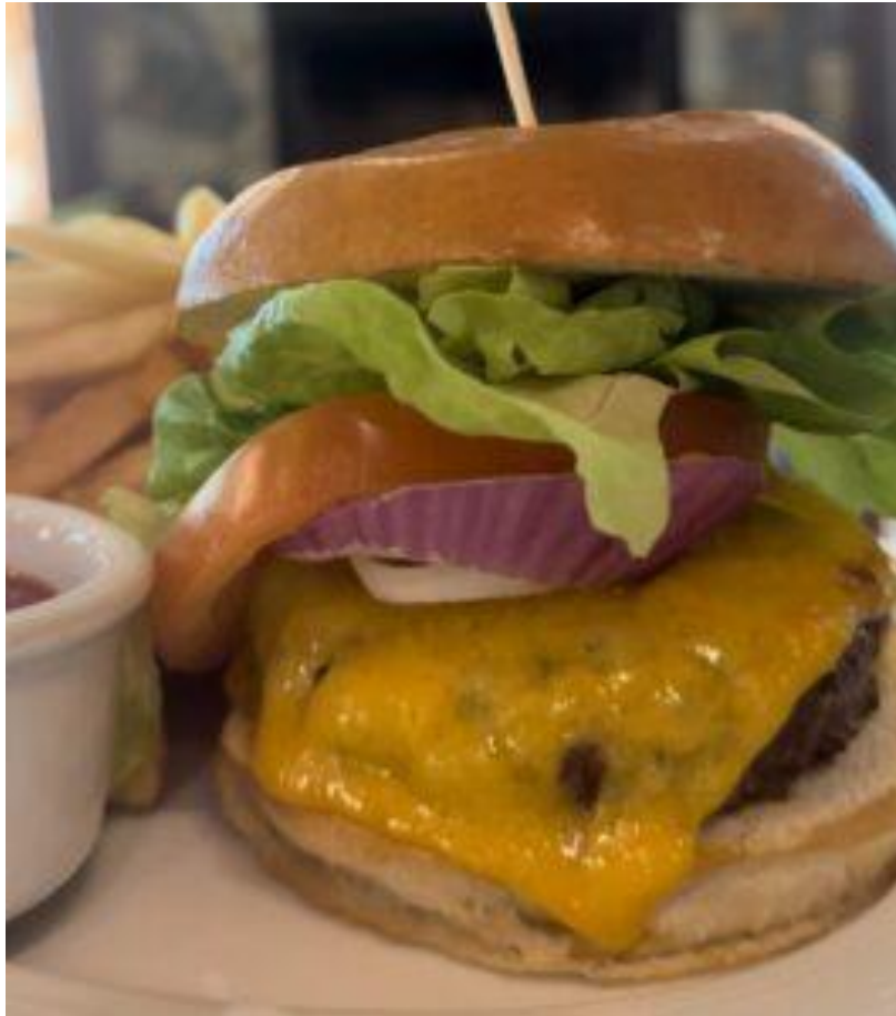
The DB Burger at Double Barrel Steak at The Preserve Resort & Spa.

expansive hunting lodge of your dreams, the restaurant also features large equestrian paintings on the walls.