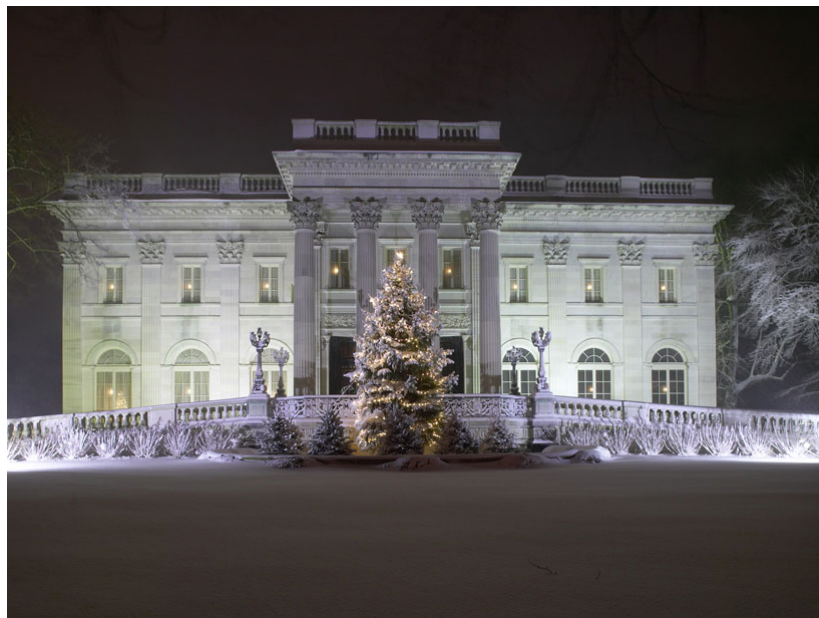
Newport's historic mansions are the perfect place for winter weekend getaways.

Whether you want to escape the cold or embrace it, head to these convenient U.S. spots during snow season.