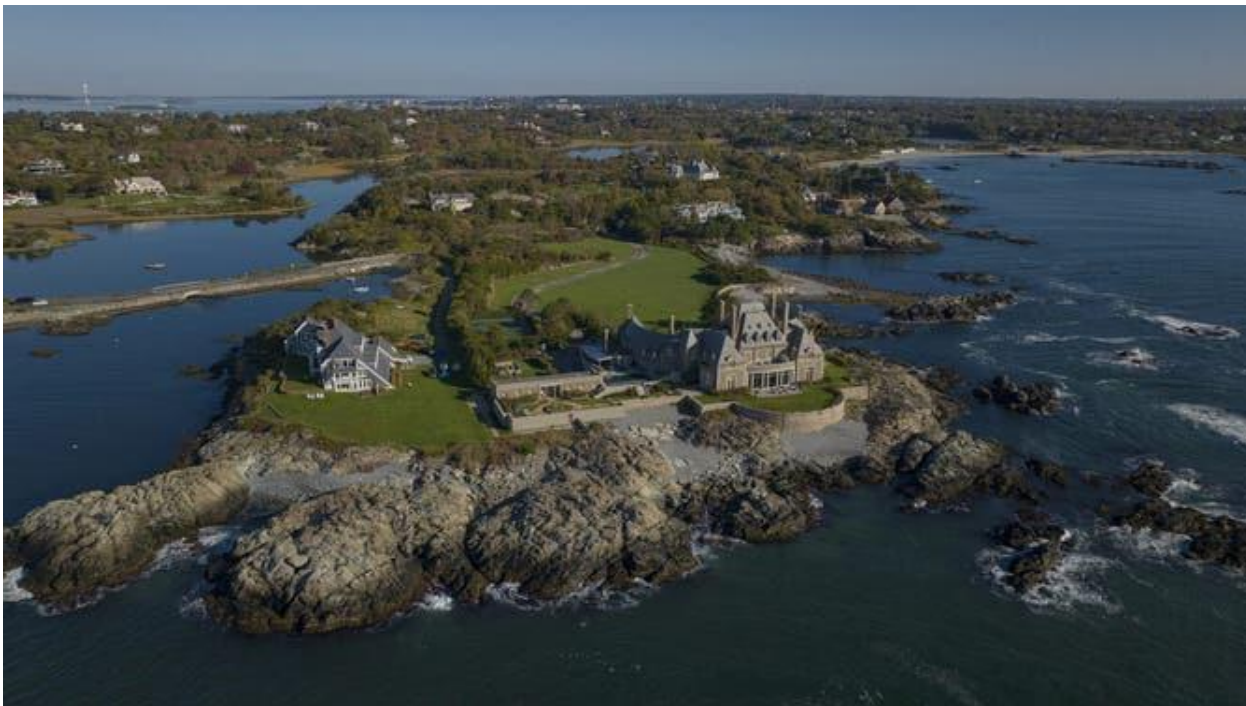
File: Aerial view of Newport Rhode Island on ocean shows historic mansions.

This tiny state is chock-full of attractions per land area. With only 1,214 square miles, vacationers are never far from something to do. It has 66 bars and clubs, 10 water parks and 54 historic sites. The small footprint is also easy to get around, the Ocean State comes in eighth for transport. The weather ranking is not very impressive at 41st.