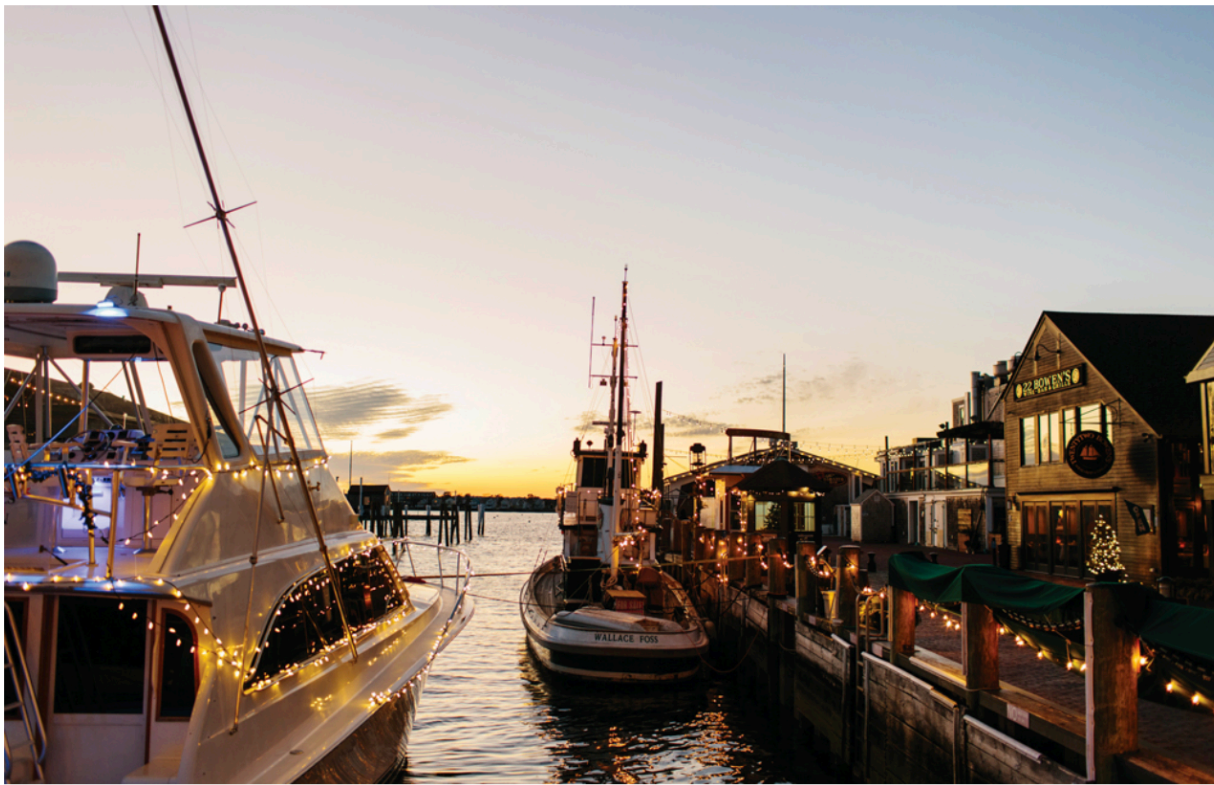
Bowen's Wharf offers a twinkling harbor vista.

It wasn't until the 19th century that the holiday gained widespread acceptance and morphed into a season associated less with debauchery and more with domesticity, gift-giving, and goodwill. That attitude shift, it turns out, was thanks in part to a seasonal resident of Newport, Clement Clarke Moore. Moore was a New York City classics professor when he wrote "A Visit from Saint Nicholas," also known as "The Night Before Christmas," in 1822 for his children. By 1850, when he began spending summers in a rambling Victorian house on Newport's Catherine Street, his widely published poem had become the national blueprint for a happy, and Santa-centric, Christmas.