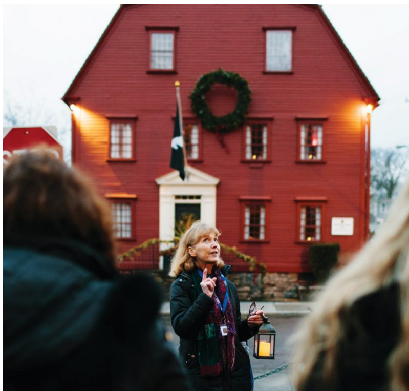
A Newport Historical Society guide leads the way on a holiday lantern walking tour.