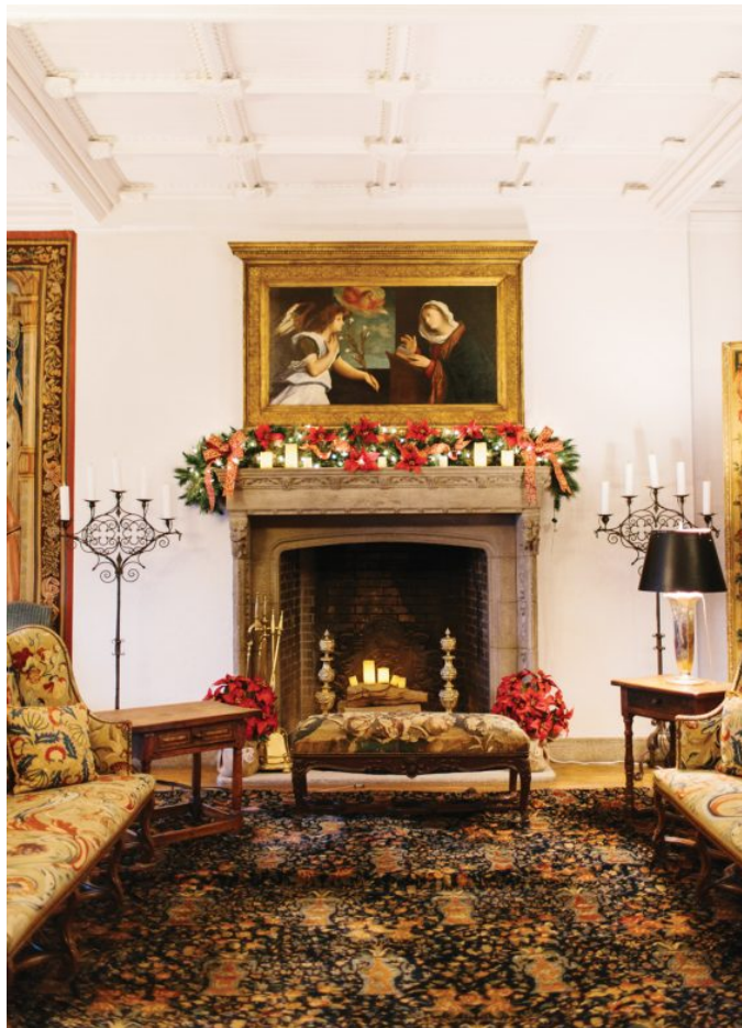
Filled with 18th-century British portraiture, 16th-century Flemish tapestries, and other collected treasures, Rough Point has been left in much the same condition as when Doris Duke lived there.

I found a more historically accurate view of what Christmas was like for Newport's elite at Rough Point, the summer home of heiress, art collector, and philanthropist Doris Duke. Though a few of the rooms in the sprawling, waterfront English manor house had been spruced up for the holidays, most were shown as they were when Duke was traveling: shrouded in ghostly white dust covers, awaiting her return. I lingered in the airy, ocean-view solarium, imagining Duke gazing out at the moody surf and her two beloved pet Bactrian camels, Princess and Baby, who roamed the grounds from 1988 to 1992. (It's said she brought the camels, now immortalized in two life-sized topiaries on the front lawn, into the solarium to ride out a hurricane.) Duke's eccentricities—she pursued belly dancing, longboard surfing, and gospel singing—were legendary, but she was also a generous and passionate preservationist. In 1968, she started the Newport Restoration Foundation, which in the past five decades has invested in and restored more than 70 early-American houses in town.