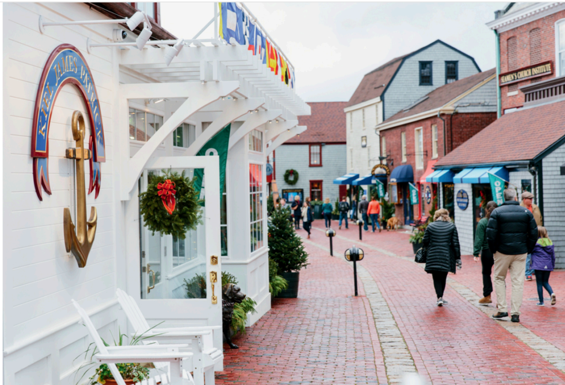
Bowen's Wharf is a magnet for visitors year-round, but during the holidays it also hosts a number of Christmas in Newport events, including the annual tree lighting.

Wind sweeps up from the harbor and rattles the boughs of bare elms as I cross Washington Square, the trapezoidal centerpiece of downtown Newport, to the Jane Pickens Theater. The restored Greek Revival movie house, built as a church in 1834 and converted into a theater in the silent-film era, has a vintage marquee, an old-school glassed-in ticket booth, and—what’s this?—a cocktail bar behind the lobby candy counter. I bring a drink into the packed house, find a seat, and wait for the lights to dim.