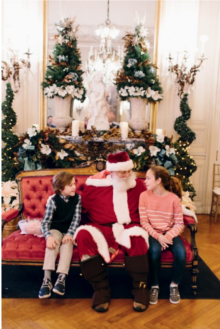
Santa welcomes some fans at the Elms.