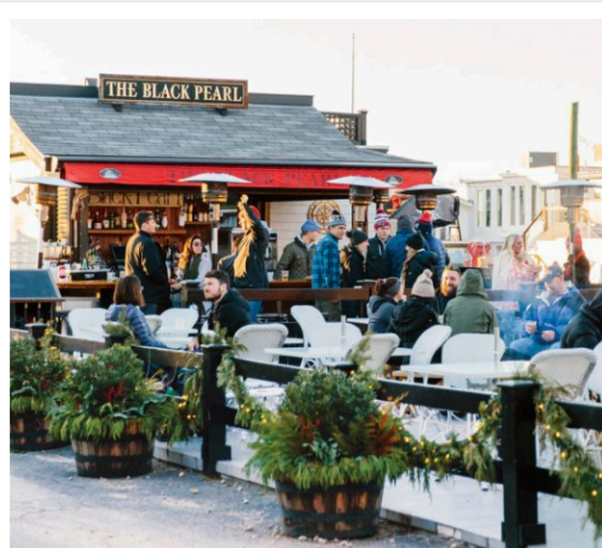
A wintry day hasn't dimmed the appeal of the Black Pearl, a popular dining spot on Bannister's Wharf.

I'd spent a mid-December weekend bouncing around this historic seaport town so deeply associated with summer pleasures—boats, beaches, opulent oceanfront “cottages”—and discovered that it throws itself into the holiday season with equal gusto. The monthlong Christmas in Newport festival, produced by more than 1,500 volunteers, jams the calendar with tours, concerts, craft fairs, and other events that are either free or raise money for local charities. Since its inception in 1971, organizers have also created, to great effect, a kind of dress code for the community by asking that only clear bulbs be used in holiday displays. When those lights come on in the blue-violet twilight, outlining everything from windowpanes to wharf posts, Newport feels twinkly and enchanted—like one of those ceramic tabletop holiday villages come to life.