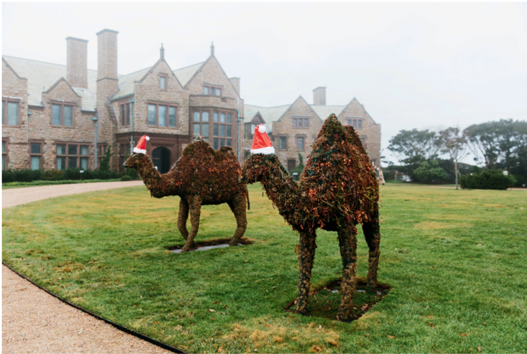
On the lawn of Rough Point, topiary versions of Doris Duke's pet camels sport jaunty Santa Claus hats for the yuletide season.