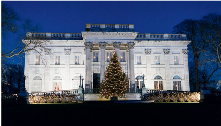
A 25-foot live tree greets visitors outside Marble House, one of the over-the-top homes featured in Christmas at the Newport Mansions .

Meg Lukens Noonan • October 24, 2019 • Add Comment