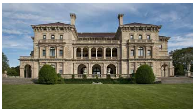
The Breakers mansion in Newport, Rhode Island, credit PSNC_Gavin Ashworth

Our base for three days in the city was the Newport Marriott, a lovely, nautical-themed hotel set on the waterfront in the historic downtown district, just a short dander to the shops and restaurants, and right next door to the Newport Welcome Centre. Parking is free in low season in an ad-