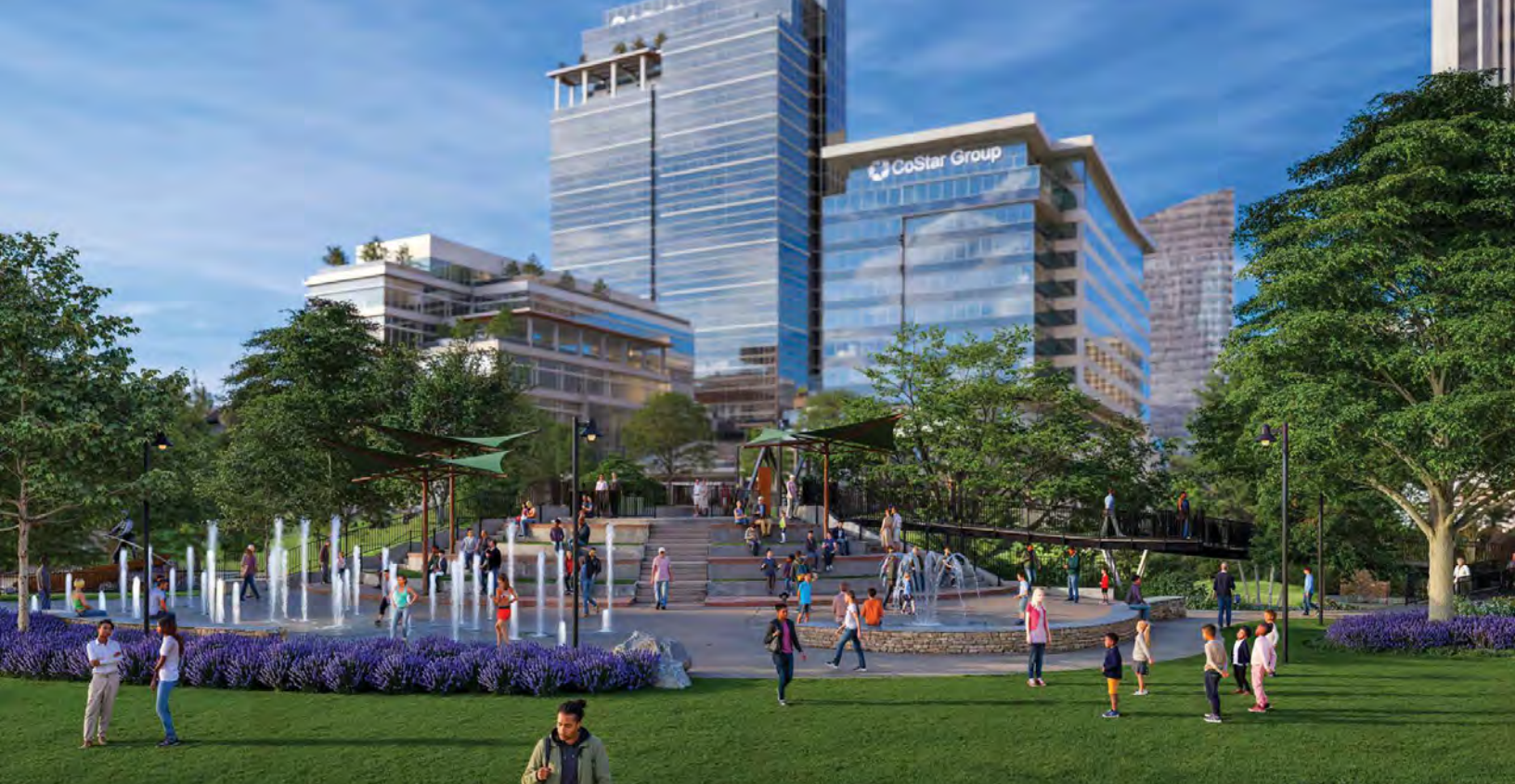
ABOVE: Splash pad play feature made possible by Dominion Energy. New shade structures, seating areas, and ADA ramp at the CoStar Group 7th Street entrance.