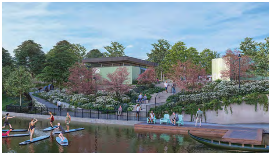
TOP: Riverfront terraces for seating and relaxation, which will provide unencumbered views and access to put visitors closer to the river than ever before.