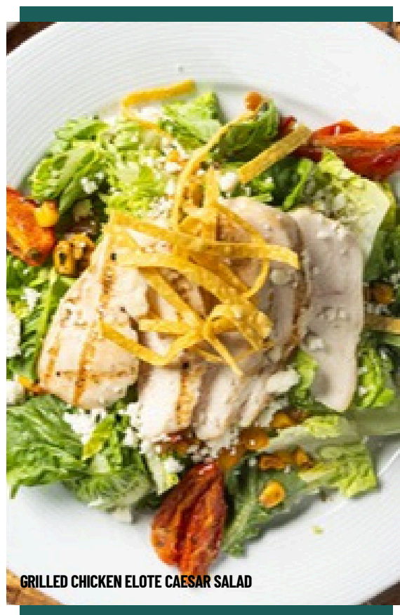
GRILLED CHICKEN ELOTE CAESAR SALAD

Grilled Chicken Breast, Tender Chopped Romaine Hearts, Roasted Corn, Crumbled Cotija Cheese, House Dried Tomatoes, Fried Corn Strips, served with a Creamy Cilantro Caesar Dressing