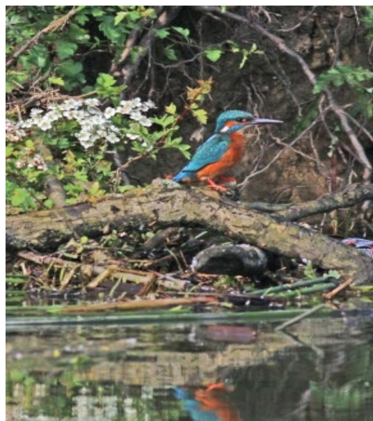
Photo: Kingfisher near the river.

What3Words address is //baker.users.provider