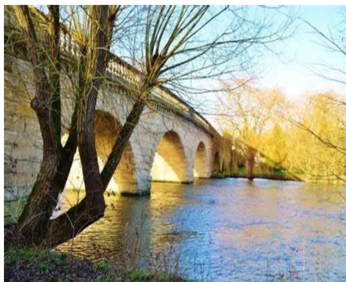
Swinford Toll Bridge

The car park is in the centre of Eynsham, which can be reached from either Clover Place or Back Lane. The car park is free (at time of writing).