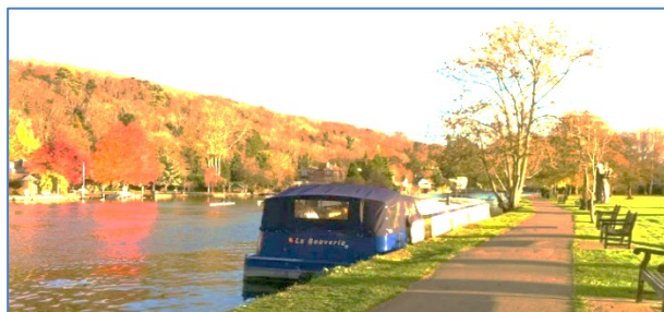
Narrow boat moored at the side of the river

Refreshments, accessible toilets and accessible parking can be found at Henley train station and the River and Rowing Museum. There are also refreshments at the Piazza (this closes in bad weather, so check ahead).