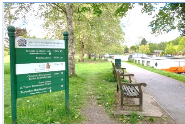
Photo showing the path through Mill Meadows