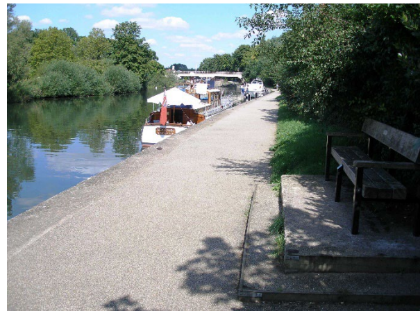
Rest stop on the route

Parking: There is pay & display parking at the rail station or Goring car park.