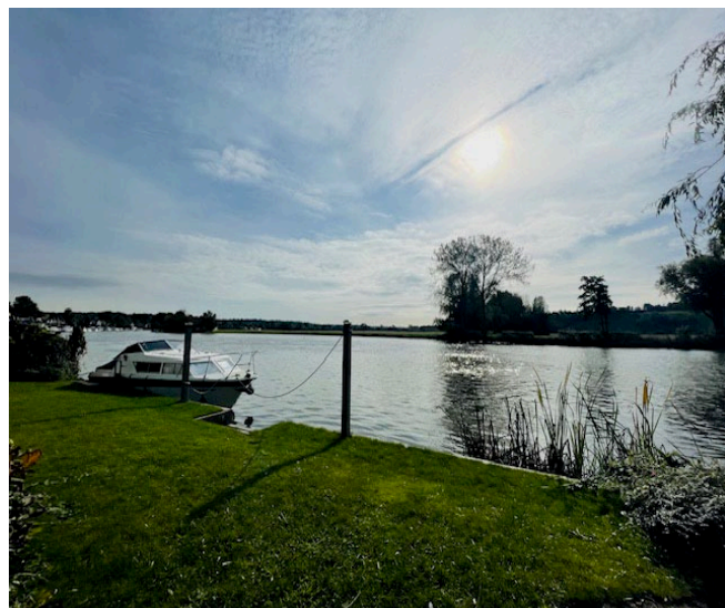
View towards Bourne End

Bus – Marlow has a good network of buses, including connections from Henley and High Wycombe.