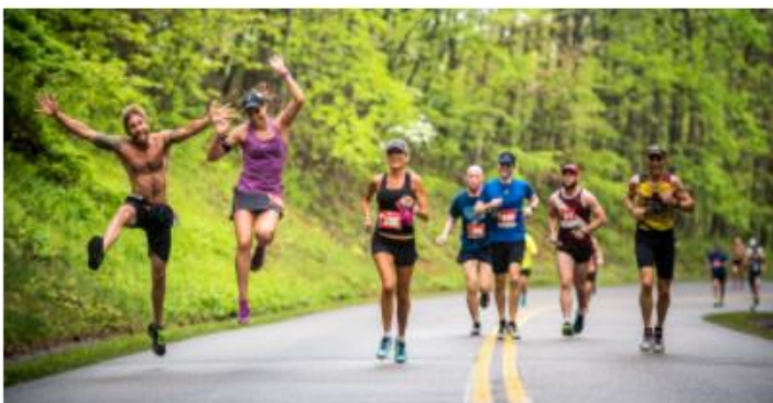
Blue Ridge Marathon

See if you have what it takes to conquer America's Toughest Road Marathon! The Blue Ridge Marathon includes 7,430 feet of elevation change and the opportunity to run on the iconic Blue Ridge Parkway. This year's race takes place Saturday, April 17 and there is still time to register to participate.