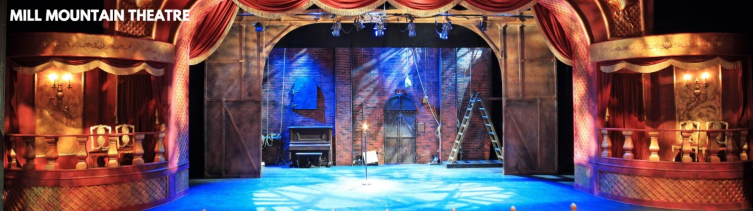
MILL MOUNTAIN THEATRE