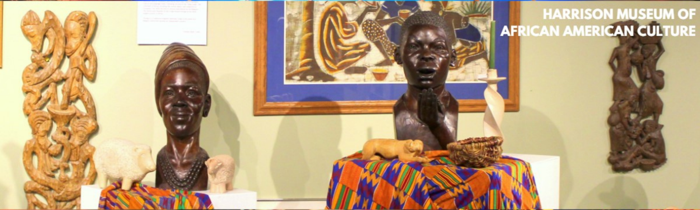
HARRISON MUSEUM OF AFRICAN AMERICAN CULTURE