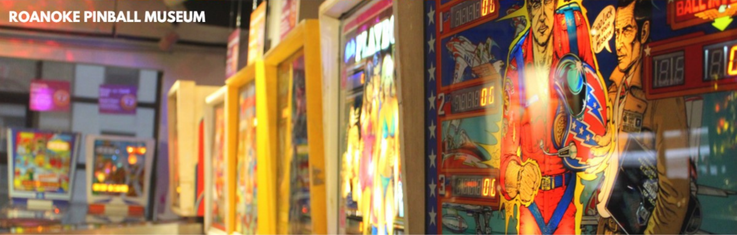
ROANOKE PINBALL MUSEUM

Discover history, games and live entertainment at Center in the Square, home to 4 unique museums, an arcade, and more!