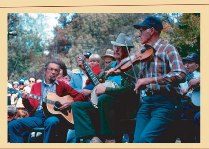
The Korn Kutters

dentist, rebuilt the water wheel for the historic mill in 1945. Floyd County also offers hiking trails, welcoming bed and breakfasts, unique restaurants, wineries, and specialty shops featuring a delightful array of local handcrafts. Looking for something? Just ask, and we'll be sure to point you in the right direction.