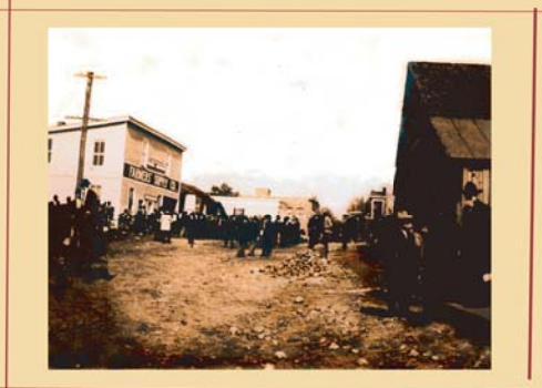
Jockey Street on Court Day

Mabry Mill, the most photographed site along the Blue Ridge Parkway, is located in Floyd County. Banjo maker Newton Hylton, a talented blacksmith, farmer, furniture maker, millwright, and country