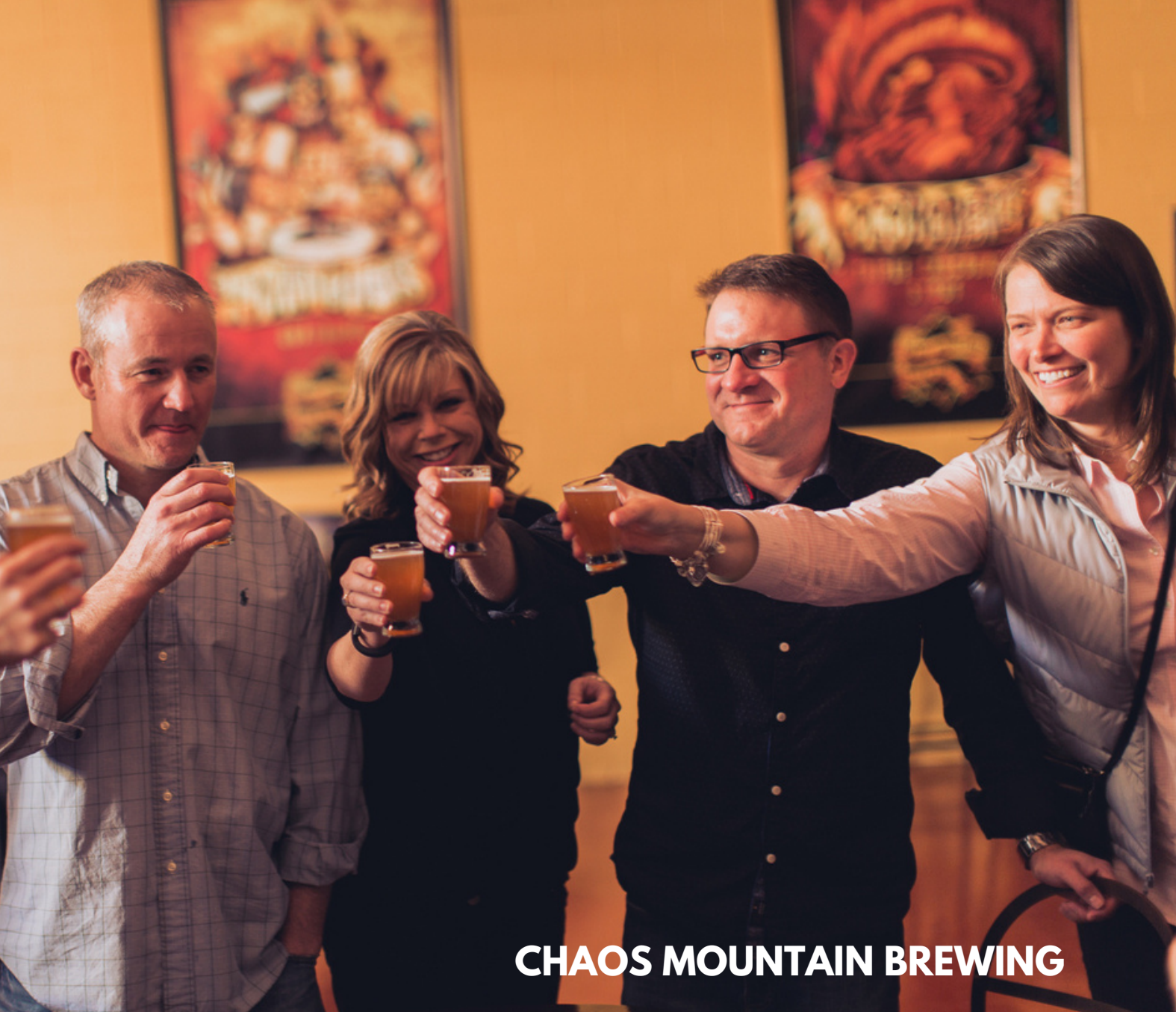
CHAOS MOUNTAIN BREWING