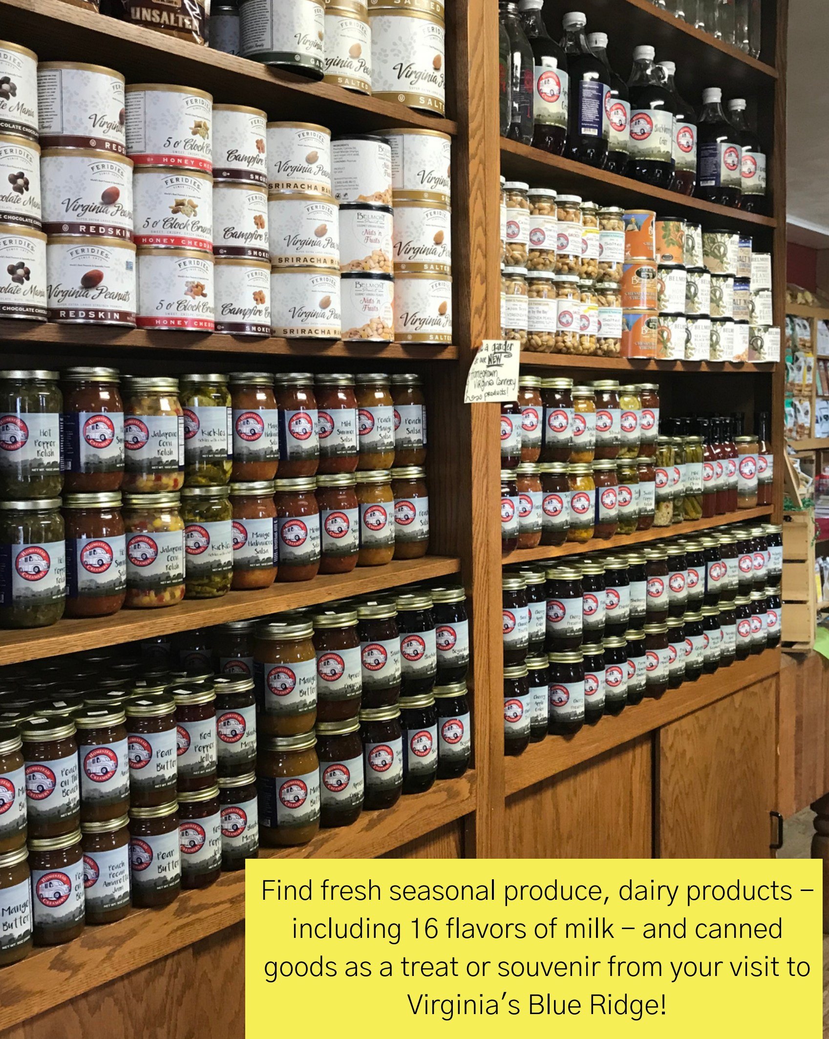
Find fresh seasonal produce, dairy products – including 16 flavors of milk – and canned goods as a treat or souvenir from your visit to Virginia’s Blue Ridge!