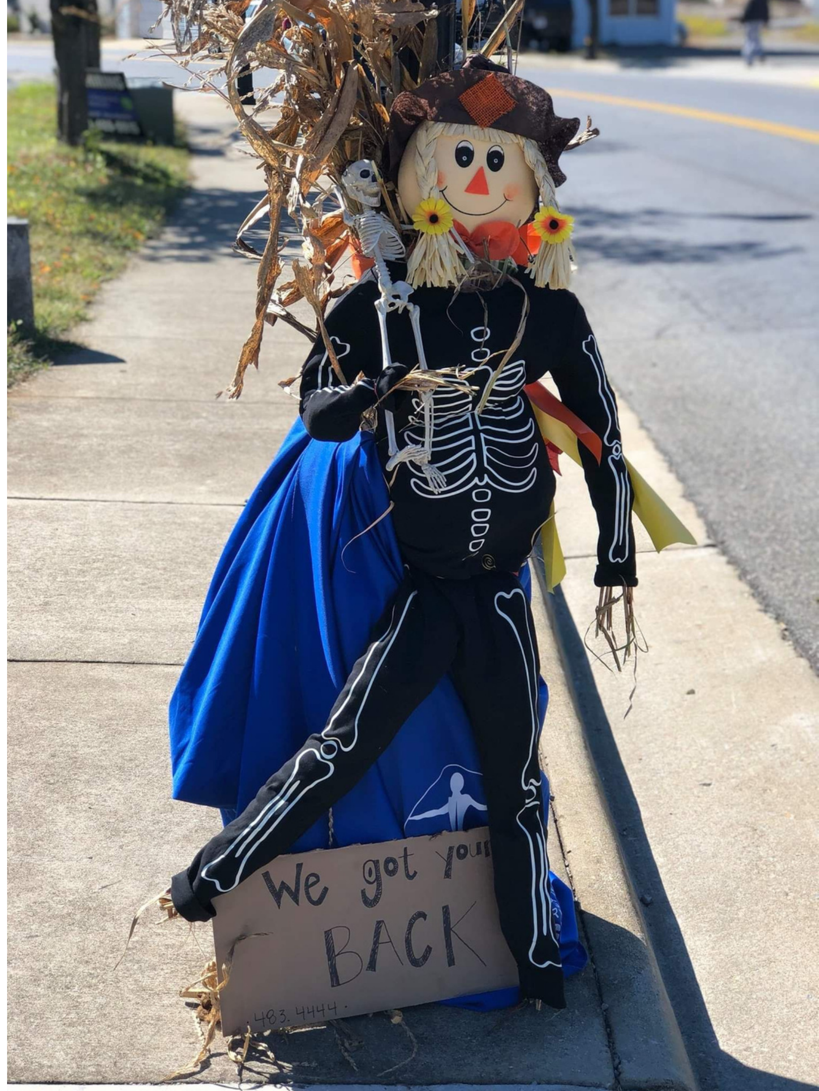
Downtown Rocky Mount Scarecrow Trail