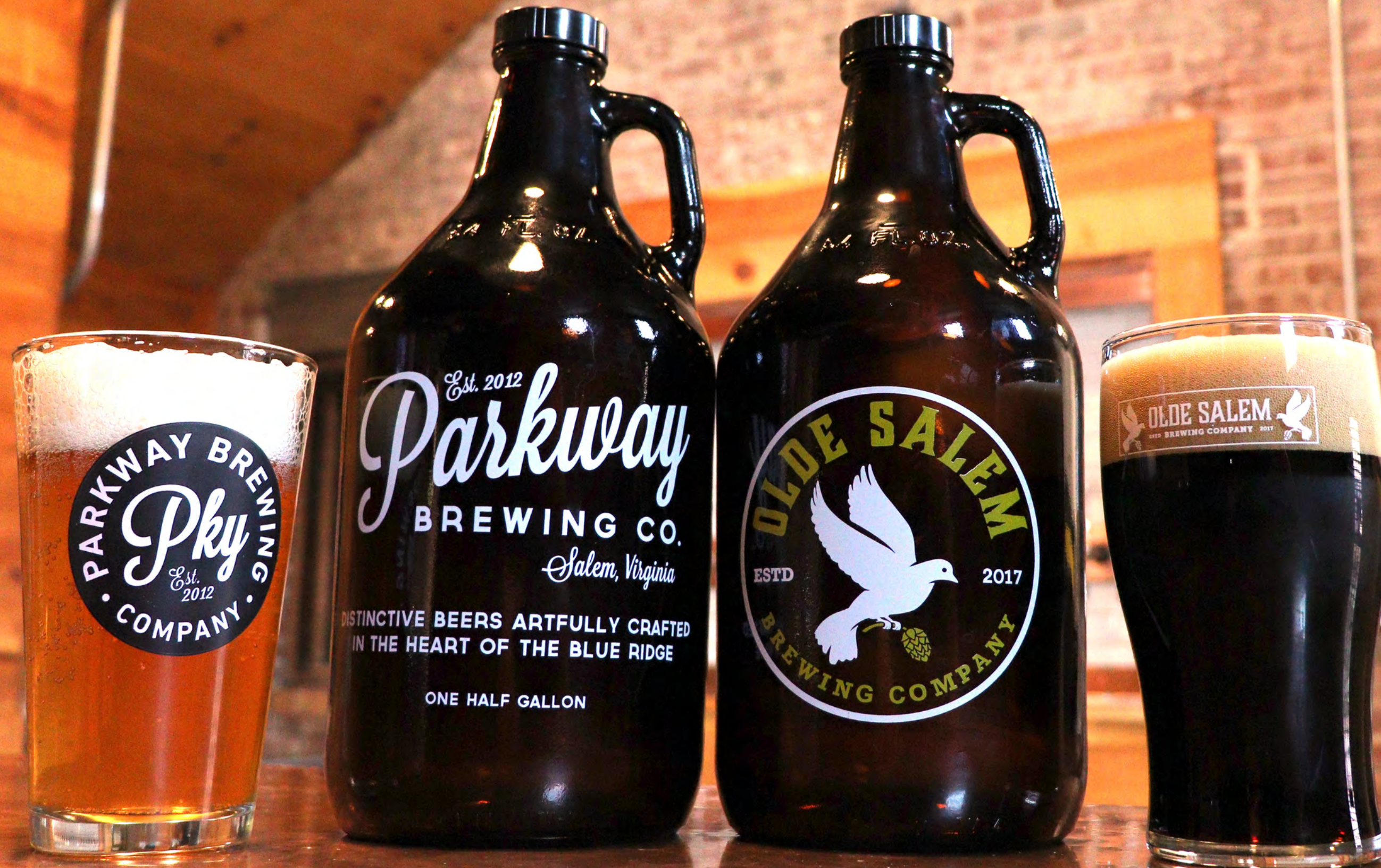
Parkway Brewing Co. & Olde Salem Brewing Company