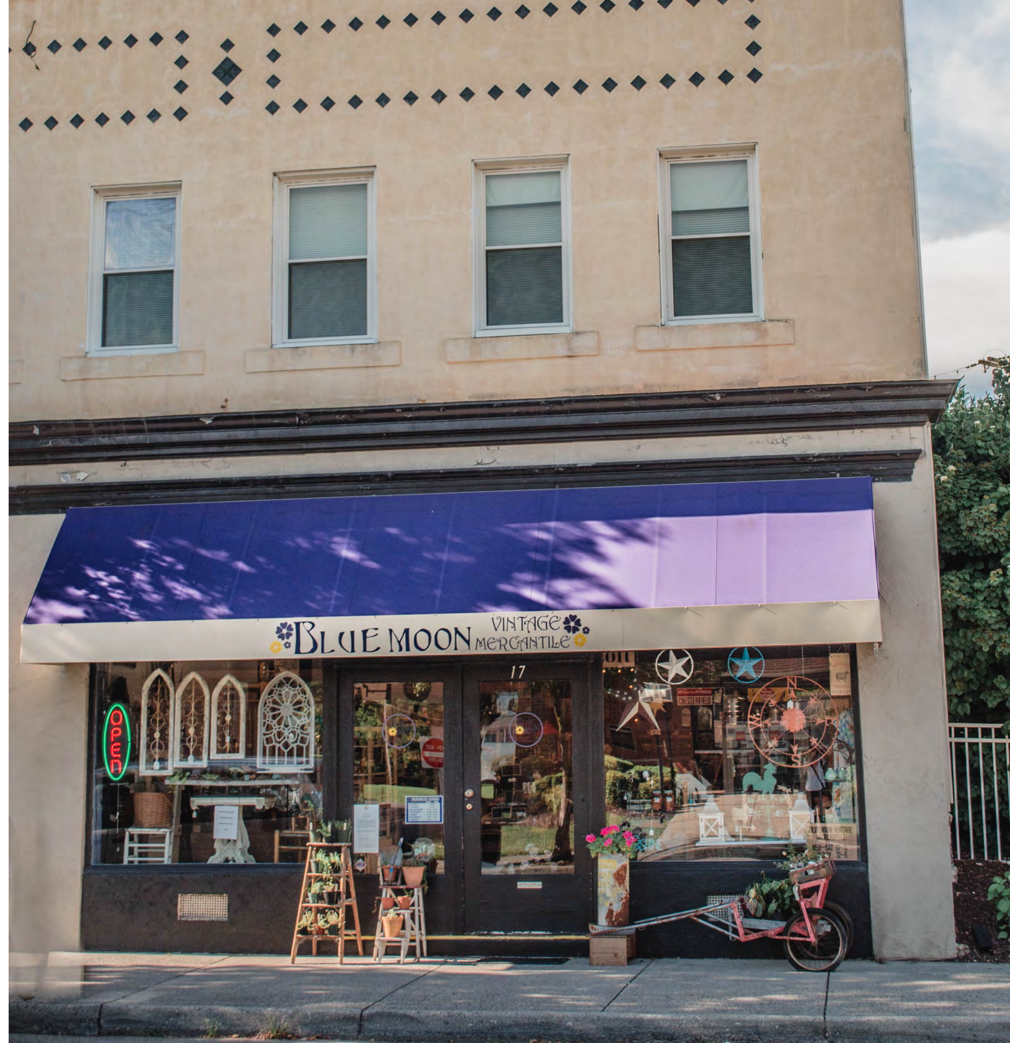
Blue Moon Vintage Mercantile