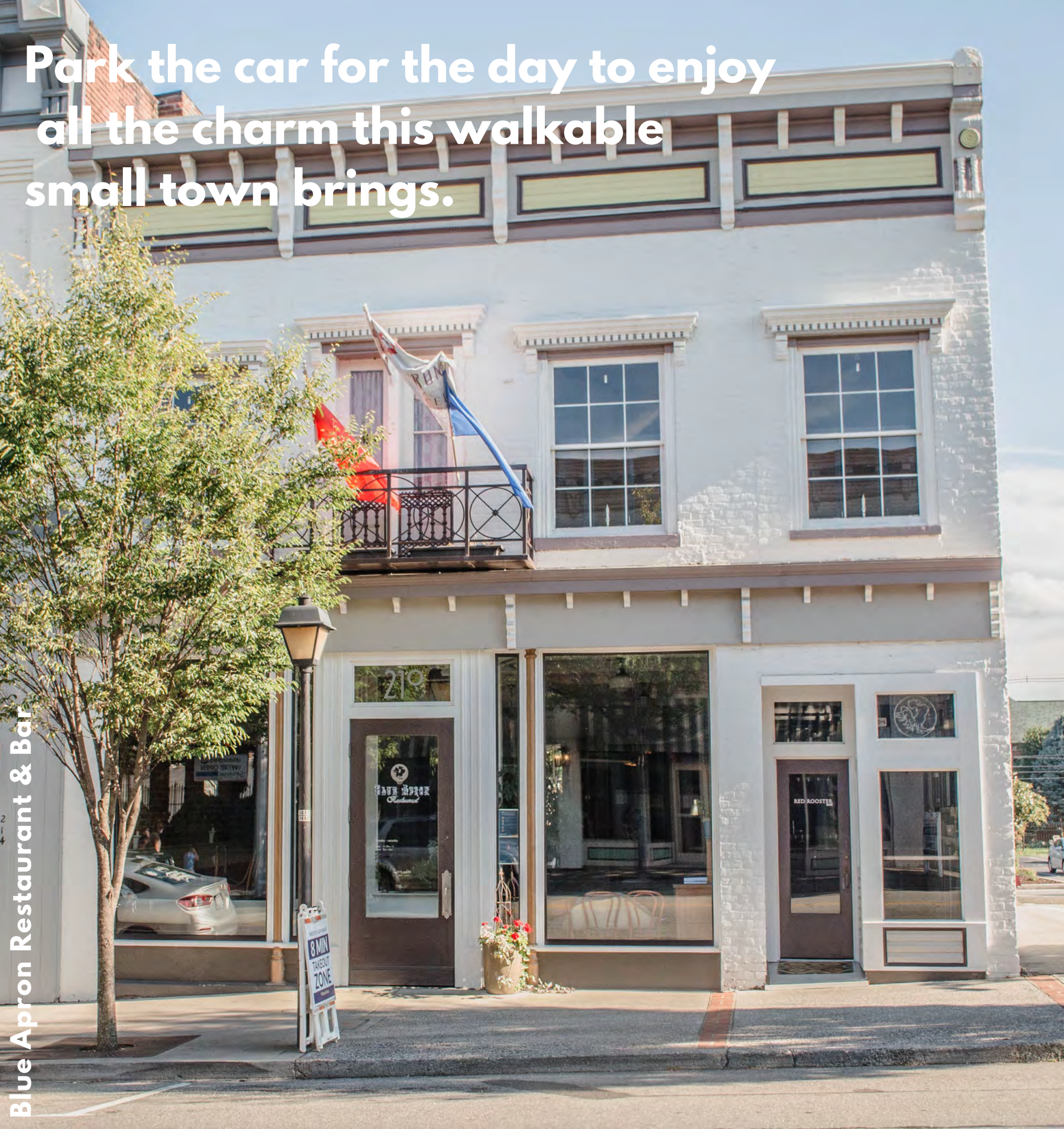
Blue Apron Restaurant & Bar

Park the car for the day to enjoy all the charm this walkable small town brings.