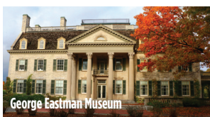
George Eastman Museum