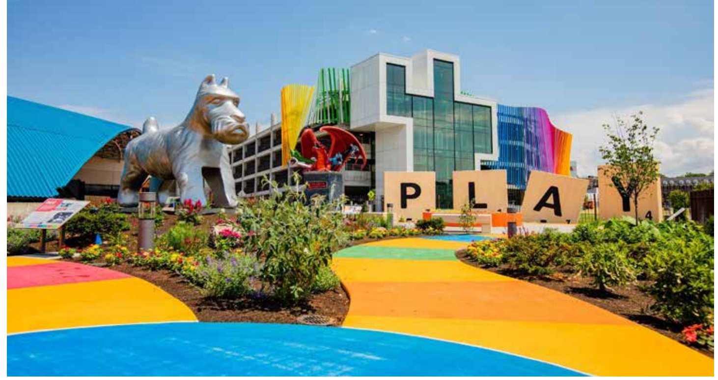
Hasbro Game Park at The Strong National Museum of Play