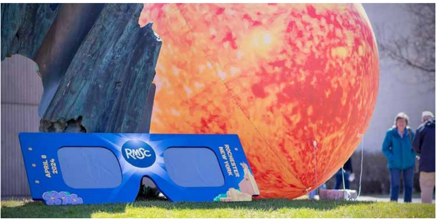
Celebrating the total solar eclipse at the Rochester Museum and Science Center