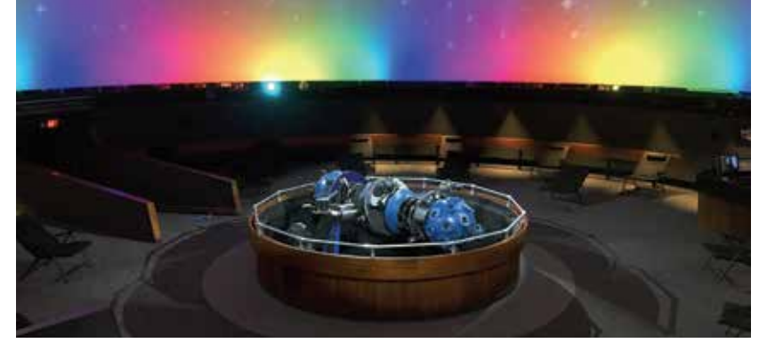
RMSC Strasenburgh Planetarium