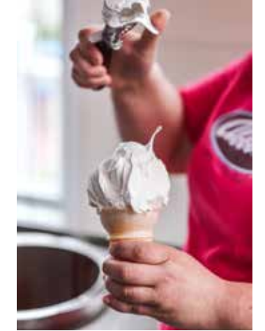
Abbot's Frozen Custard