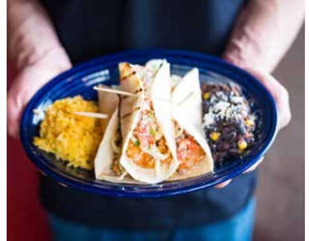
Salena's Mexican Restaurant