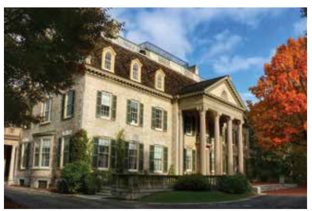
George Eastman Museum