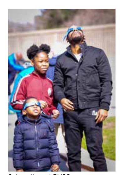
Solar eclipse at RMSC

Genesee Valley Field House Our celebration delves into life in darkness beyond 4 minutes. Millions face occlusion daily. Join us for hands-on activities like light sound box interpretation, tactile exhibits, space science talks, audio darts, tandem biking, guide training, beep baseball, tactile map-making, audio description, free tax prep, and 3D printing. All abilities welcome.