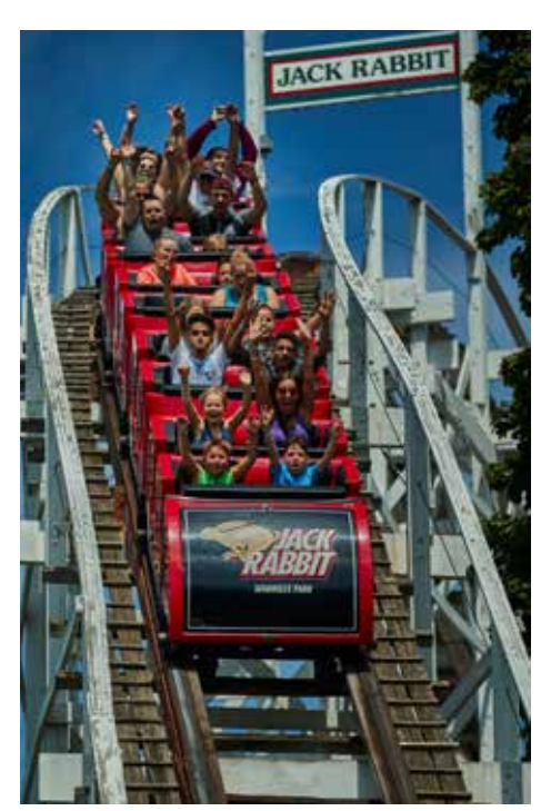
Seabreeze Amusement Park