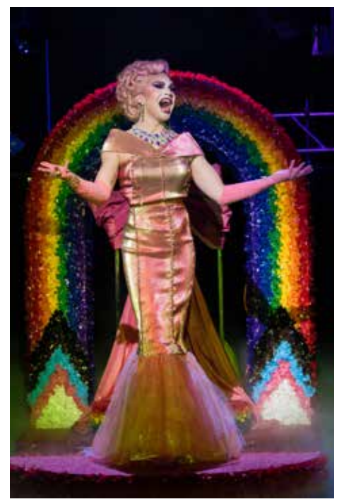
Geva Theatre