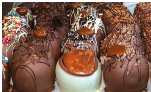
Chocolate fever at Morton Arboretum.

Woodstock, Illinois—where Bill Murray filmed Groundhog Day —celebrates with movie-themed fun, like film site tours and trivia games. On Feb. 2, witness Woodstock Willie surface and ask yourself—shadow or no shadow? woodstockgroundhog.org