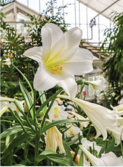
Inside Wilder Park Conservatory.