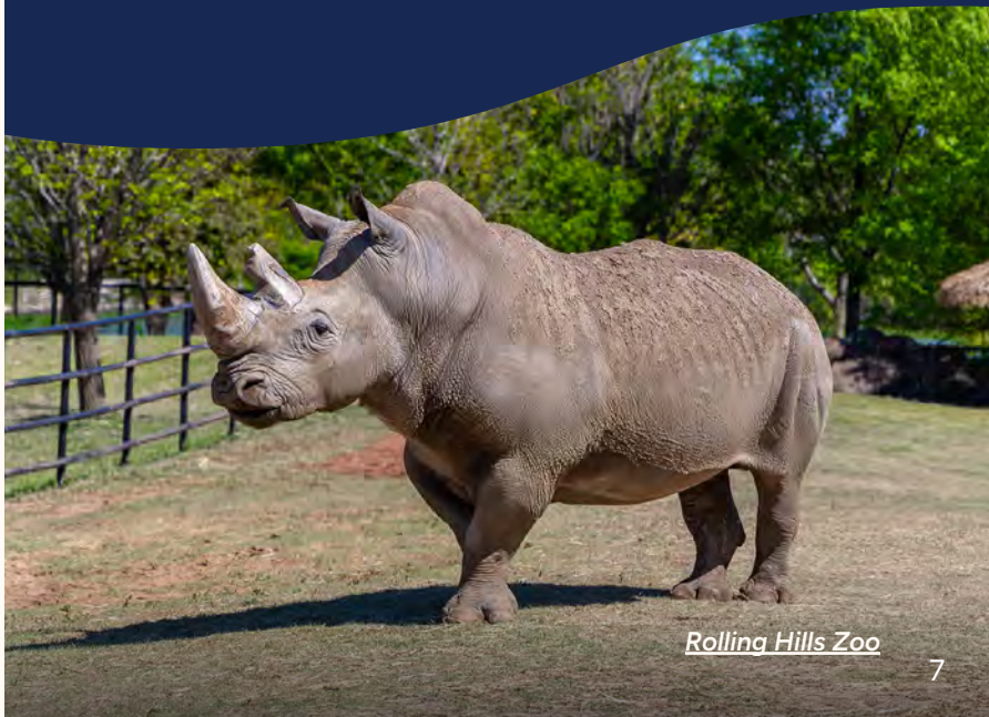
Rolling Hills Zoo