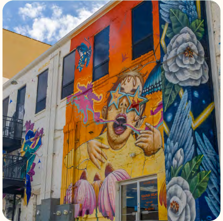
Artwork Alley , Multiple artists, near 140 S. Fifth St. in Salina, KS.