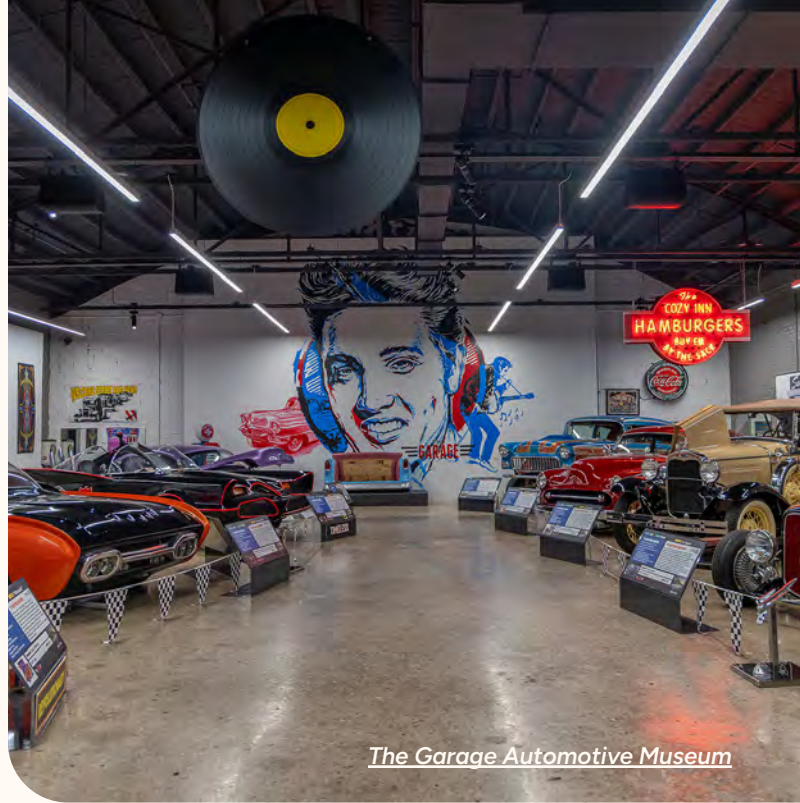
The Garage Automotive Museum

What sets Salina apart is its balance. Spend your day exploring a vibrant downtown filled with local shops, restaurants, and public art, then unwind in scenic parks, trails, and wide-open spaces. Families will find plenty to do, from interactive attractions to outdoor adventures.