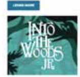
INTO THE WOODS JR.

There's still time to join in the fun this Friday in Courthouse Salisbury. The 10th annual Wine About Winter will take place February 3 through 5 throughout downtown in our bars, restaurants, specialty shops and boutiques. Learn more and buy tickets online.