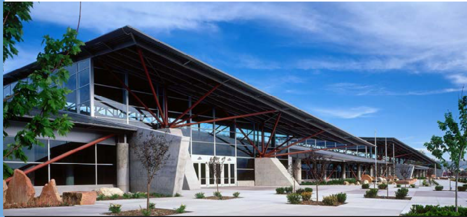
The South Towne Seismic Bracing Project will Begin Next Quarter.

Boiler Refractory Replacement: The project will remove and replace the boiler refractory side wall and replace it with a 2600 degree insulating fire brick and 3000 degree mortar bond. A one-inch layer of insulation will be installed against the exterior brick walls. The project is expected to begin mid-October and should take about three days to complete.