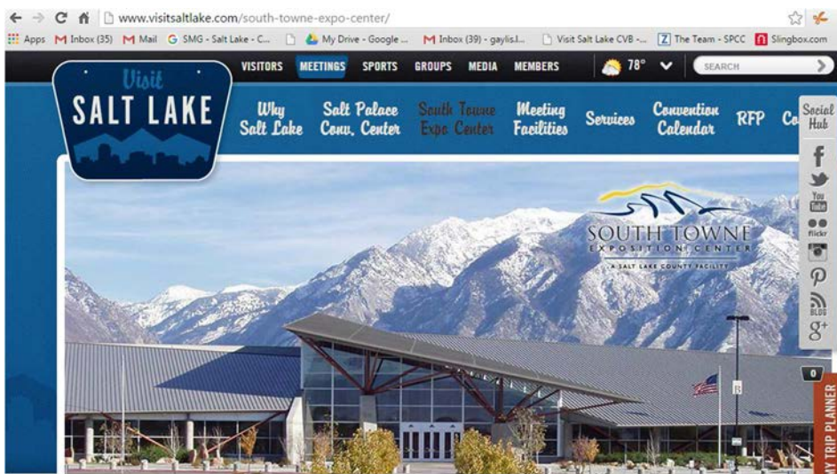
South Towne Expo Center 's new web site is now part of VSL's site.