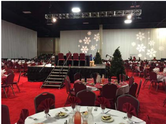
Modern Expo & Events Decked the Hall for Holiday Parties

There was also a diverse mix of other uses for the facility during the quarter, including: The Utah Snow & Avalanche Workshop, K-9 Nose Work, Utah Health Care Association Emergency Preparedness Training, NCEES Engineering & Surveying Exams, National Guard Job Fair, Utah State University Open House, Utah Valley University Open House, IATSE Local 838