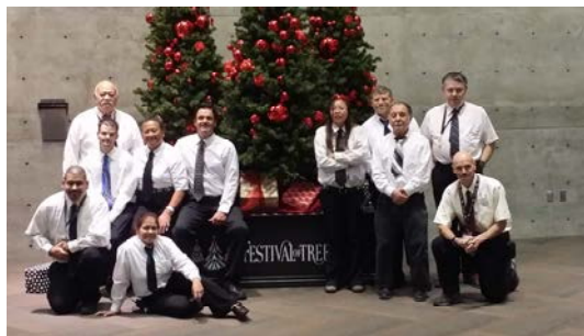
South Towne Event Staff Dressed Up for Opening Night of the Festival of Trees.