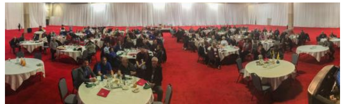
Staff End-of-Year Meeting at South Towne

There were also a couple of private holiday parties .