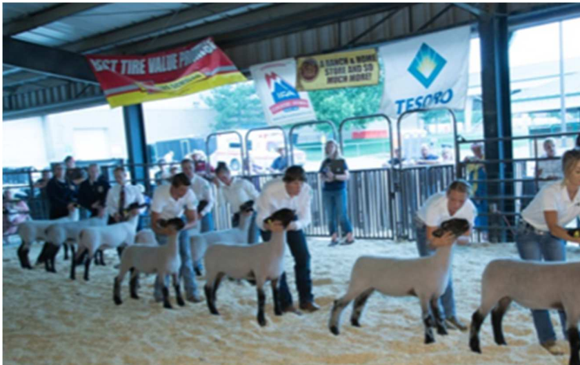
4-H members show their lambs during the livestock judging competition.