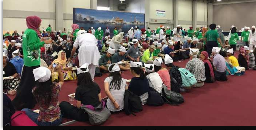
Members of the Utah Sikh Community Hosted a Daily Langer \,-\!-\! a Community Kitchen Feeding People at No Charge.