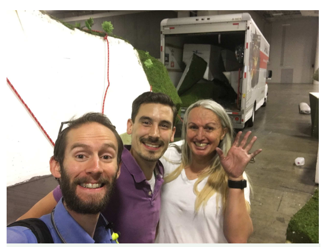
This donation is headed to Highland High School in Ogden to be used in their Fine Arts Program.