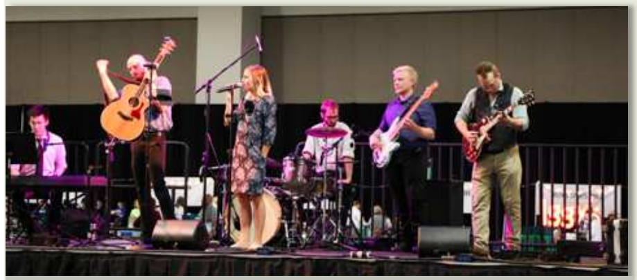
Lots of local entertainment was featured during the Road Home's Chili Affair