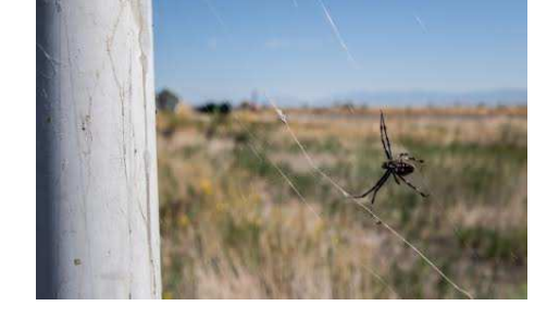
Giant spiders were everywhere!

Crews had to be on constant alert to avoid the giant and overly abundant spiders and their webs. Employees from the Salt Palace