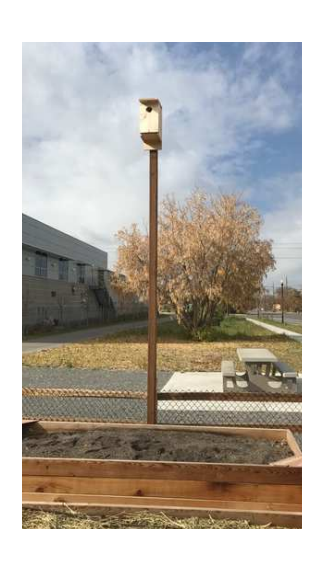
Home Sweet Bird Home