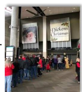
Gun Show and the Crossroads of the West Dicken's Family Christmas

Show, the Gluten & Allergen-Free Expo, Bridal Extravaganza and the Dicken's Family Christmas.