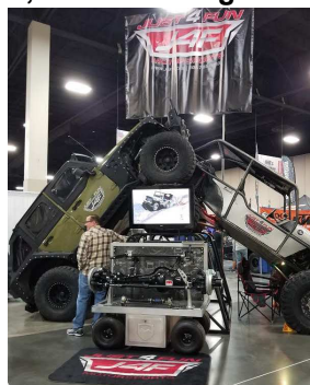
Utah Off-road Expo Display

of the West Gun Show, Wasatch Fly Tying and Fly Fishing Expo, Little Adventures Outlet Sale, Prepper Con, Home & Gadget Expo, New Consciousness Expo, What a Woman Wants, Let's Create Expo, Salt Lake Off-road Expo, Utah Quilting and Sewing Marketplace, Rocky Mountain Antique Festival, Larry H. Miller 1,000 Used Car Sale, Rocky Mountain Gun Show, Parent Day Out Boutique, Hot Tub, Swim & Spa Sale, AARP Fraud Watch Network Event, Discover the Dinosaurs Unleashed and Healthy Food Expo.