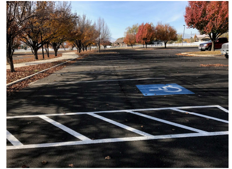
New asphalt and striping on the main lot.

Tickets can be purchased online, in advance at: http://christmasincolor.net/ . Check the website for special promotions. Cost is $25 per vehicle (some restrictions apply).