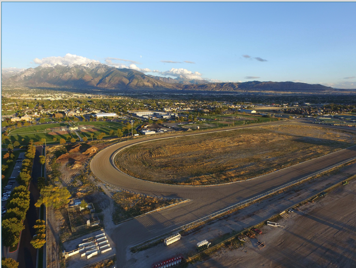
This aerial view features the racetrack. The shoot captured various views from around the Park for its photo library.