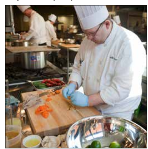
The CIA offers cooking classes, the CIA Bakery Café for pastries and sandwiches, and NAO: New World Flavors, a rising star featuring Latin cuisine.