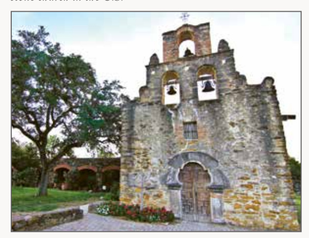
Mission Espada is one of the five Spanish Colonial missions built along the San Antonio River.

DISCLAIMER The City of San Antonio does not guarantee the accuracy, adequacy, completeness, or usefulness of any information. Individuals assume all risk and responsibility. Please note that many of these routes mix with urban vehicular traffic.