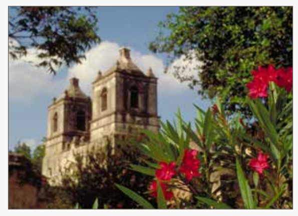
Mission Concepción stands proudly as the oldest unrestored stone church in the U.S.

The Visitor Center at Mission San José offers exhibits and a short video about the history of the missions. You'll find water fountains and restrooms at each mission.