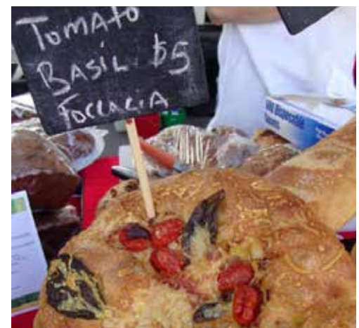
Don't miss the local produce and baked goods at the Saturday Farmers Market at the Pearl.