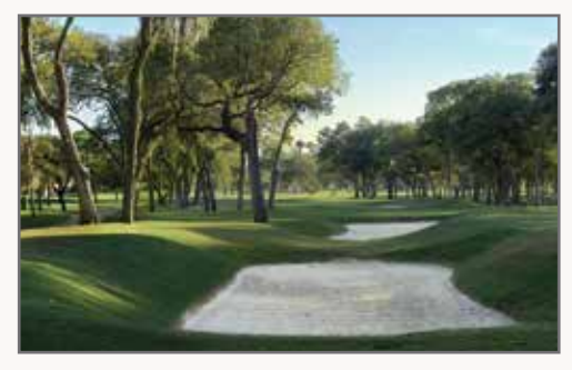
This Brackenridge Park Golf Course was designed in 1915 and is the the oldest 18-hole public course in the state.

As you leave the park, you'll travel along Avenue B, which is a dedicated, family friendly bike path, and then you'll hit Josephine St. which will lead you to N. Alamo St. which will take you back toward downtown.