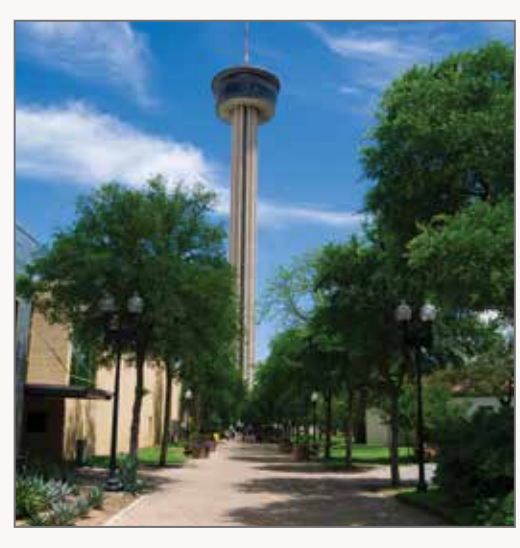
You will pass HemisFair Park which was built to host the 1968 World's Fair. You will also pass the Tower of the Americas.

DISCLAIMER The City of San Antonio does not guarantee the accuracy, adequacy, completeness, or usefulness of any information. Individuals assume all risk and responsibility. Please note that many of these routes mix with urban vehicular traffic.