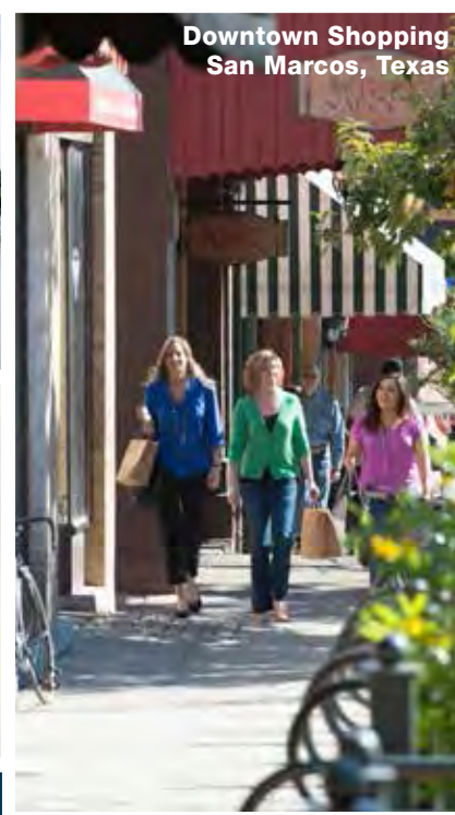
Downtown Shopping San Marcos, Texas