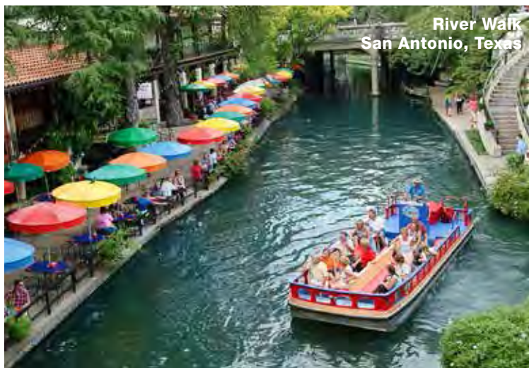
River Walk San Antonio, Texas