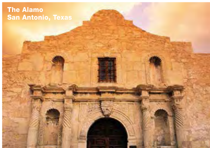
The Alamo San Antonio, Texas