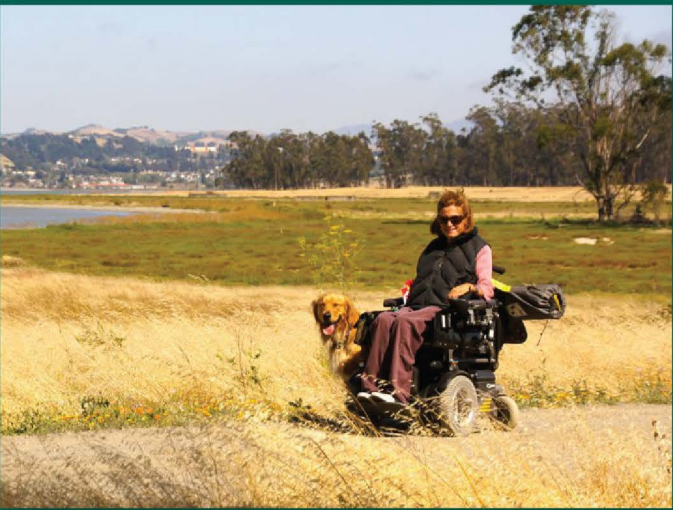
Point Pinole Regional Shoreline, Richmond

Making the Bay Trail a reality involves a collaborative effort between a wide-variety of public agencies and private organizations. Together, these organizations build, operate, and maintain the various parts of the Bay Trail. Completing the remaining miles of Bay Trail will require the continued efforts of these public and private partnerships. Park bonds, transportation fund-