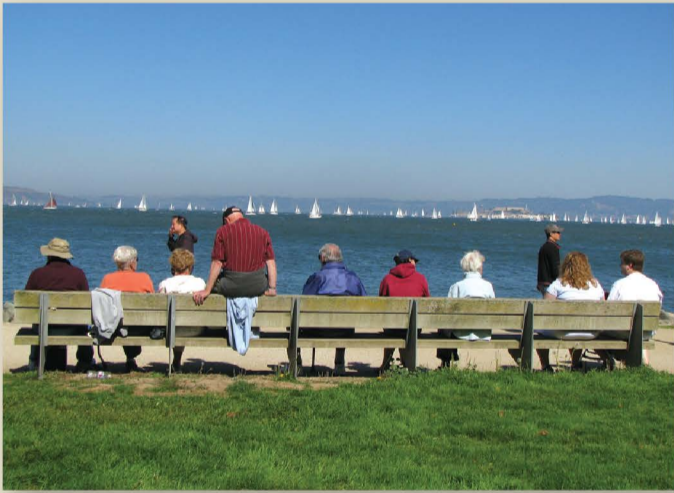
Views of the Bay