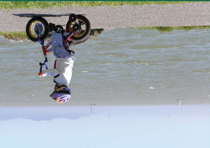
Love for the Bay Trail starts early at Cesar Chavez Park

The San Francisco Bay Trail is a 500-mile shoreline walking and bicycling path that will one day encircle the entire bay. If you have ever cycled across the Golden Gate Bridge, skated around Bay Farm Island, or walked in the Palo Alto Baylands, you have experienced the Bay Trail. Made up of paved multi-use paths, dirt trails, bike lanes, and sidewalks, the trail passes through urbanized areas like downtown San Francisco as well as remote natural areas like the Don Edwards San Francisco Bay National Wildlife Refuge. With over 340 miles in place, the Bay Trail is a collaborative effort between a wide-variety of public agencies and private organizations. Together, these organizations build, operate, and maintain the various parts of the Bay Trail.