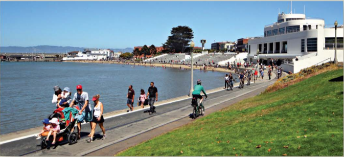
Aquatic Park, San Francisco