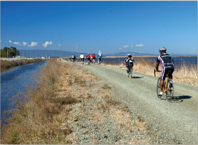
Moffett Bay Trail