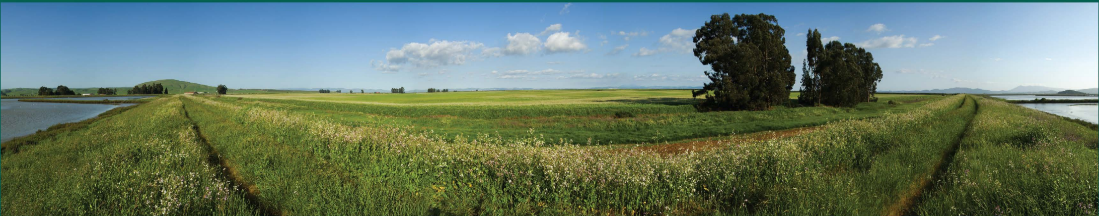
Sonoma Baylands

The State Coastal Conservancy is a principal funding source for the development of the Bay Trail. Established in 1976, the Conservancy is a State agency that uses entrepreneurial techniques to protect and improve coastal and Bay Area natural resources and to provide public access to the shore.