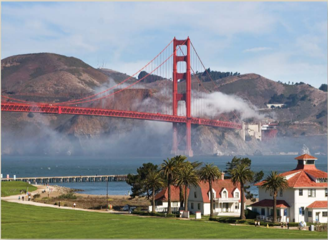
Golden Gate Promenade at Crissy Field