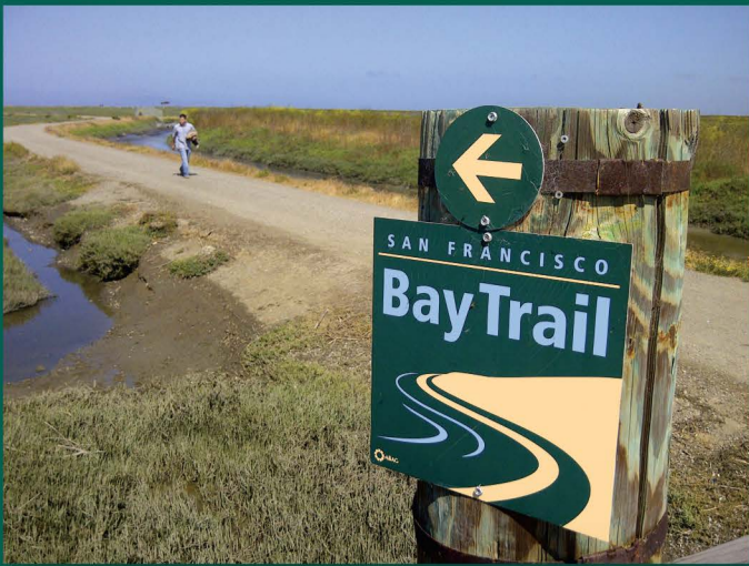
Look for the Bay Trail sign when out on the trail

The San Francisco Bay Trail is a visionary plan for a 500-mile walking and bicycling path that will one day allow continuous travel around San Francisco Bay. Over 340 miles of trail are complete in the form of multi-use pathways, levee-top trails, bike lanes, and sidewalks. Eventually, the Bay Trail will link the shoreline of nine