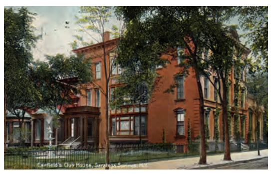
The Canfield Casino in the early 1900's

In 1913, the once great Congress Hall Hotel, which bordered Broadway opposite the current Visitor Center, was acquired for back taxes. The hotel and other structures, including Hamilton Spring and the Congress Spring bottling plant, were razed by the village in 1913. The section of Putnam Street that once intersected East Congress Street, was obliterated. Landscape engineer Charles Leavitt was retained to design a master plan for this new section of the park. In the 20th century, anti-gambling legislation, two World Wars and the Depression brought hard times to Saratoga Springs.