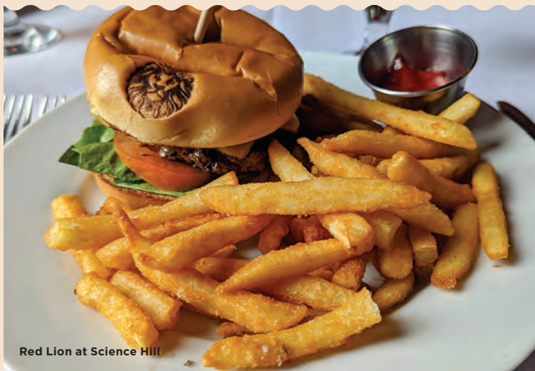
Red Lion at Science Hill

as a true example of country cooking at its best, serving as a delicious family-style restaurant.