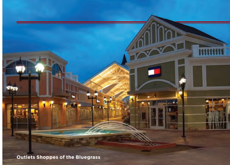
Outlets Shoppes of the Bluegrass

The Outlet Shoppes of the Bluegrass is the only Outlet Shopping center in the state of Kentucky and Kentucky's newest shopping destination. Save 25-60% in 90 well-known designer outlets including, Coach, Banana Republic, Kentucky's only Restoration Hardware, Nike, North Face, Under Armour, & Vera Bradley. Enjoy the Food Court, with center court fountains and fireplace. Ask for group tour specials.