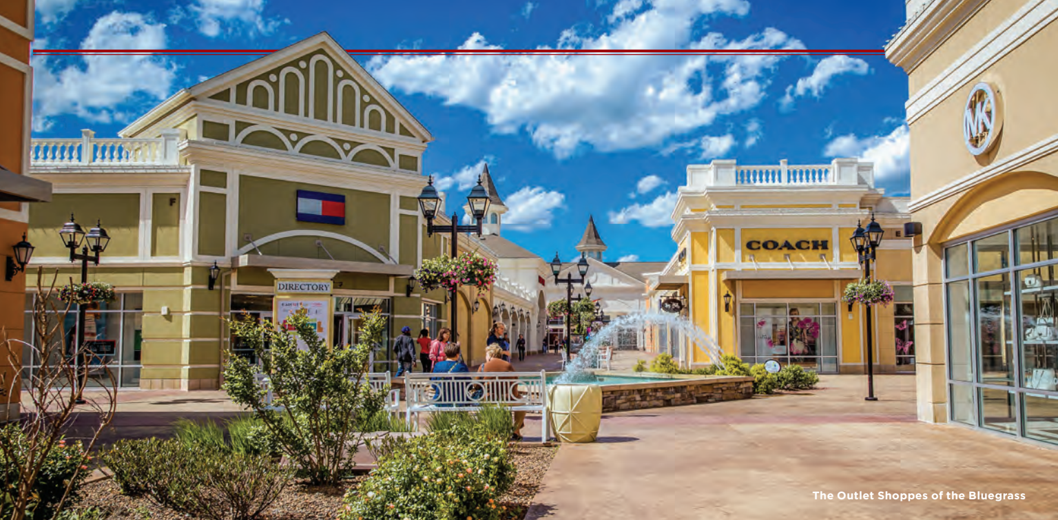
The Outlet Shoppes of the Bluegrass