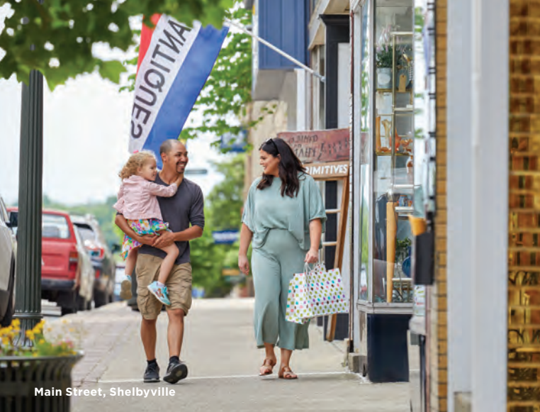
Main Street, Shelbyville