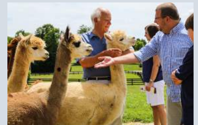
Alpaca Farm Tour