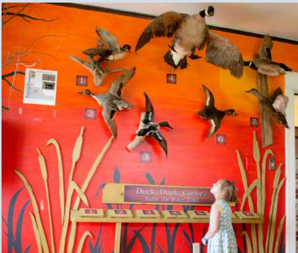
Miller Outdoor Educational Center