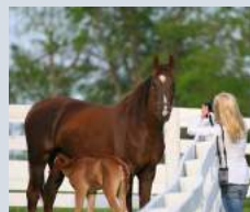
Horse Farm Tour