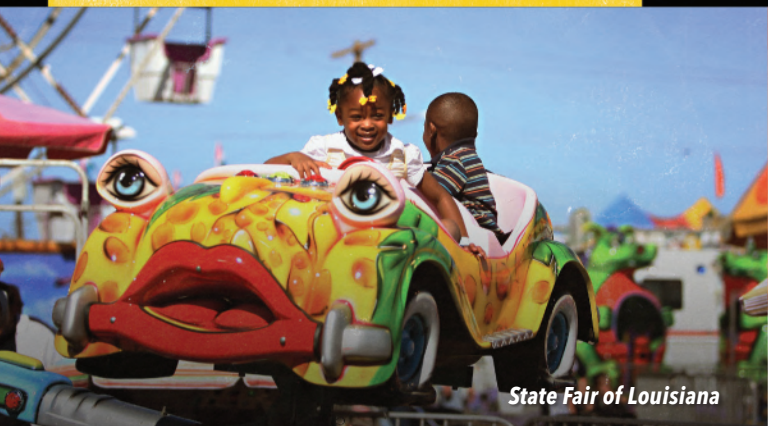
State Fair of Louisiana