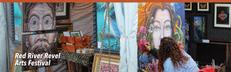
Red River Revel Arts Festival