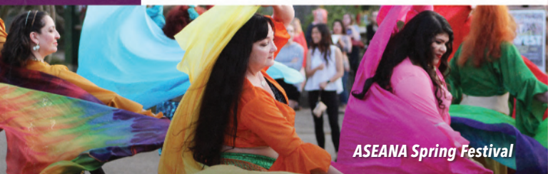
ASEANA Spring Festival