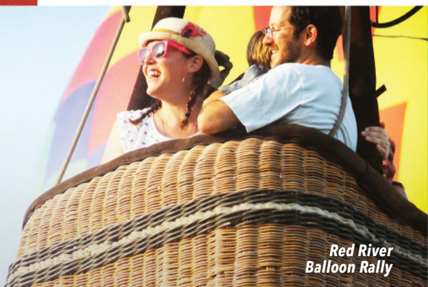
Red River Balloon Rally

318-222-9391 | www.redriverballoonrally.com