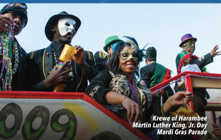
Krewe of Harambee Martin Luther King, Jr. Day Mardi Gras Parade