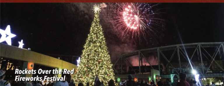
Rockets Over the Red Fireworks Festival