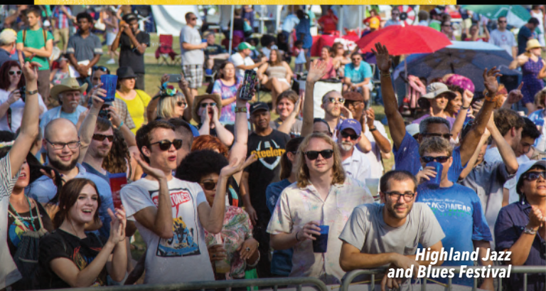
Highland Jazz and Blues Festival