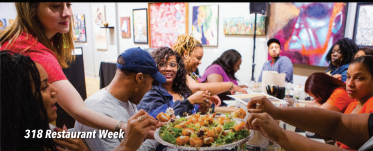
318 Restaurant Week