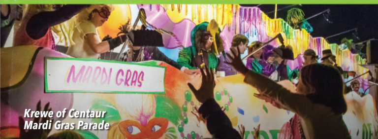
Krewe of Centaur Mardi Gras Parade