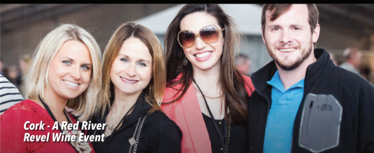
Cork - A Red River Revel Wine Event