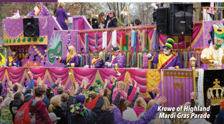
Krewe of Highland Mardi Gras Parade

318-402-1132 | www.thekreweofhighland.org